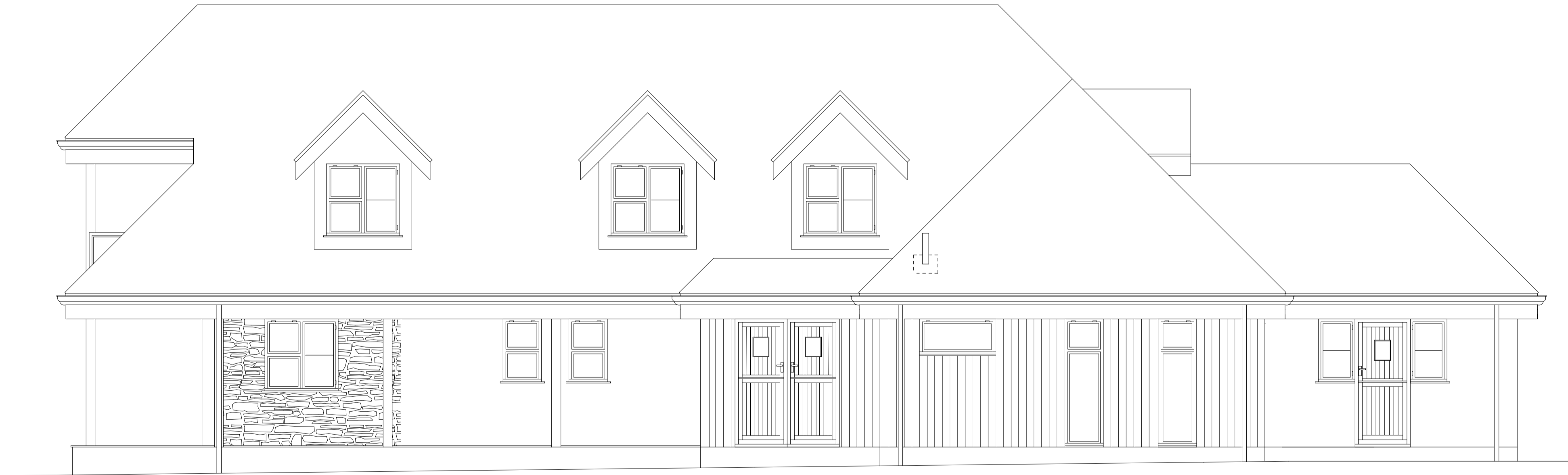
Front Elevation ( South )