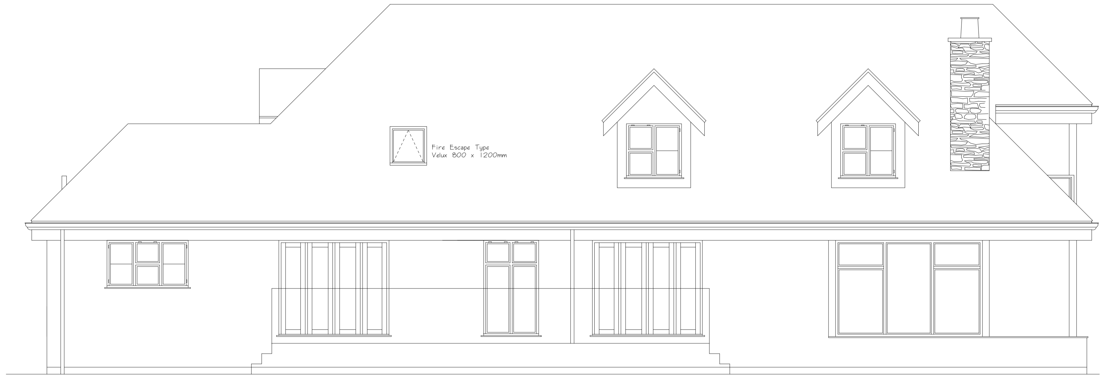
Rear Elevation ( North )