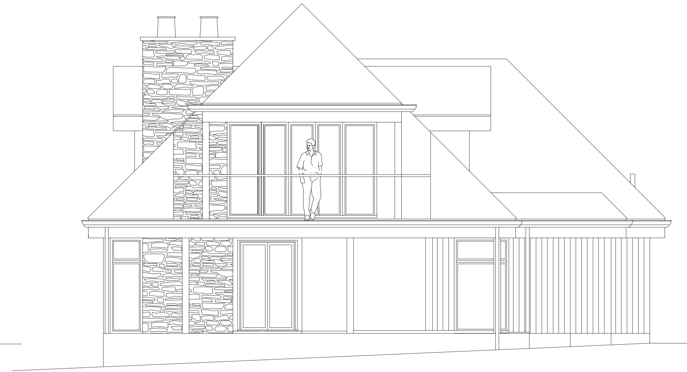
Side Elevation ( West )