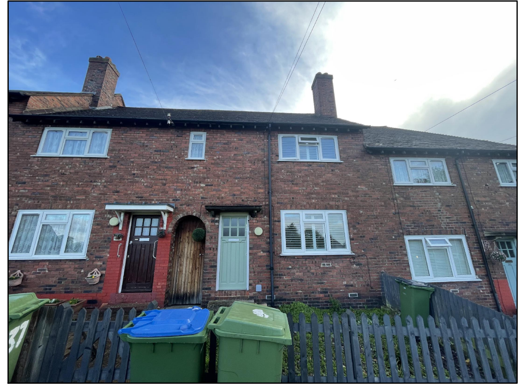
F R O N T V I E W