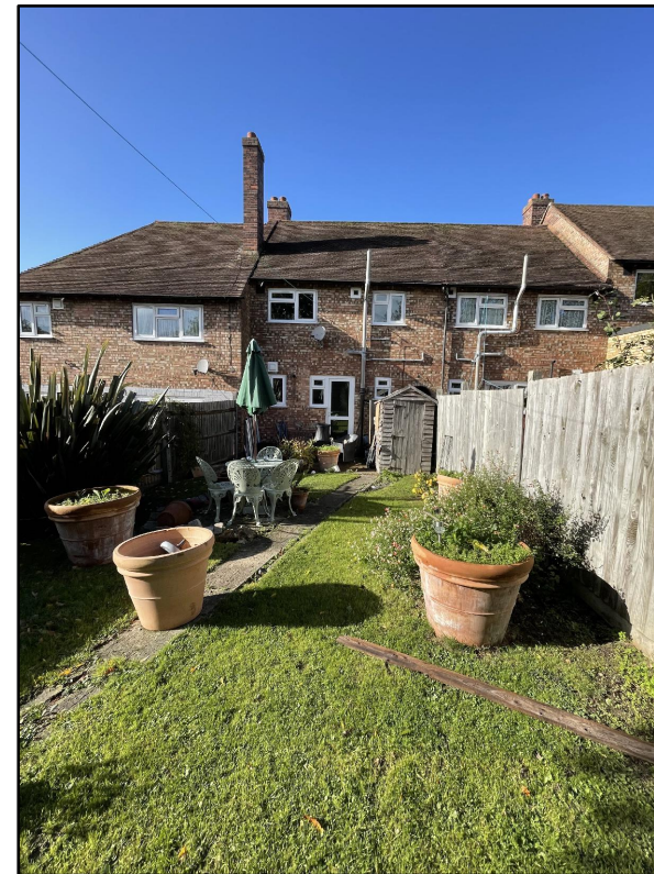
R E A R V I E W

DATE: 2023.06.01 DRAWING No: 001 DRAWING TITLE: PHOTOGRAPHS - EXISTING SITE SCALE: N/A