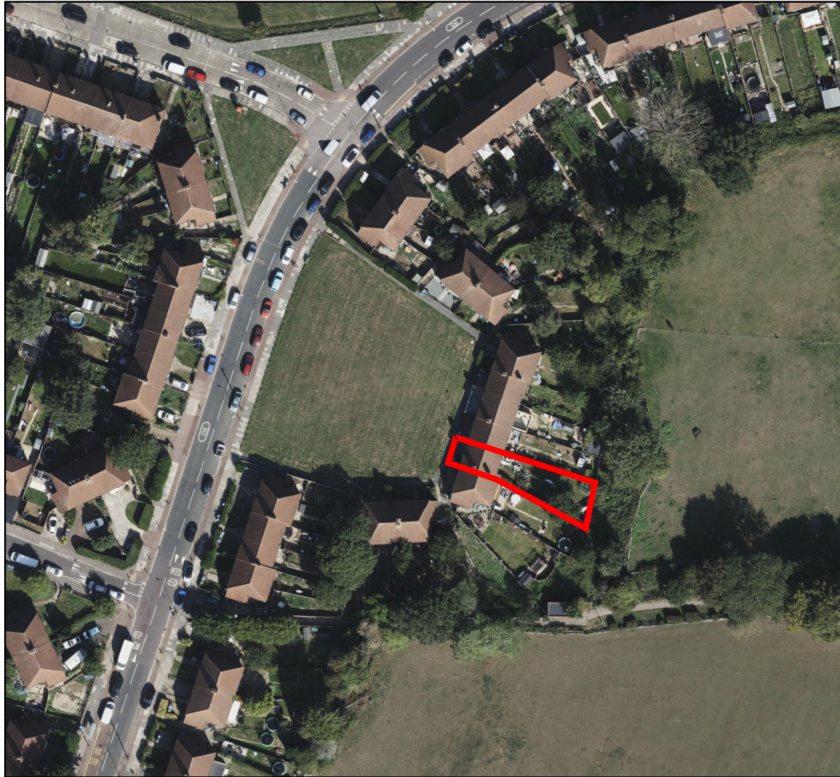
A E R I A L V I E W