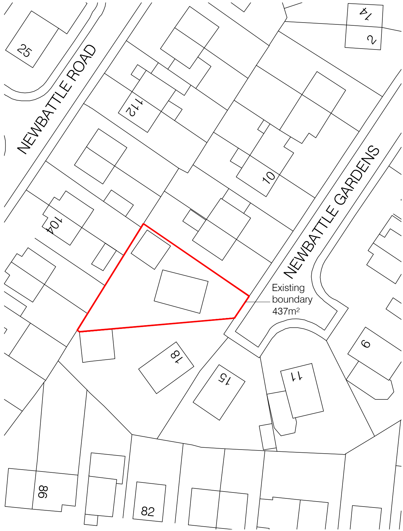
Existing Site Plan 1:500 @ A3