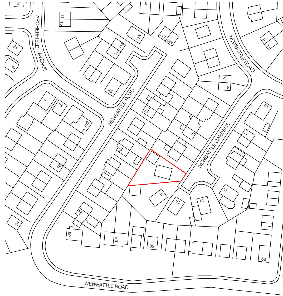
Existing Location Plan 1:1250 @ A3