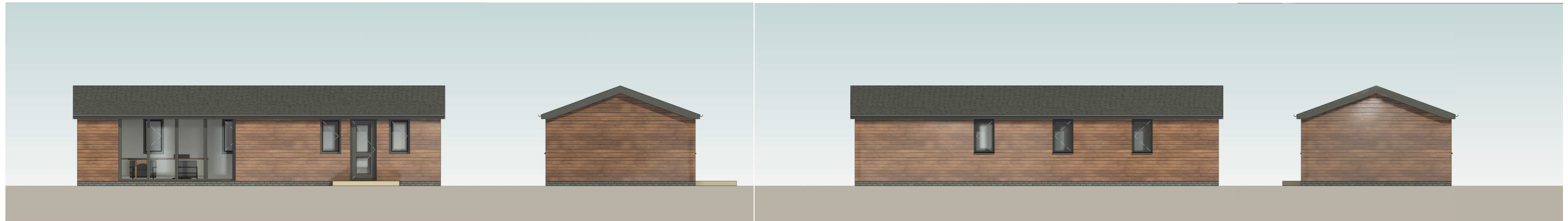
South 1 : 100

GreenArk Woodland Nursery, Tithe Barn Lane, Scorton, Lancsater, PR3 1BH