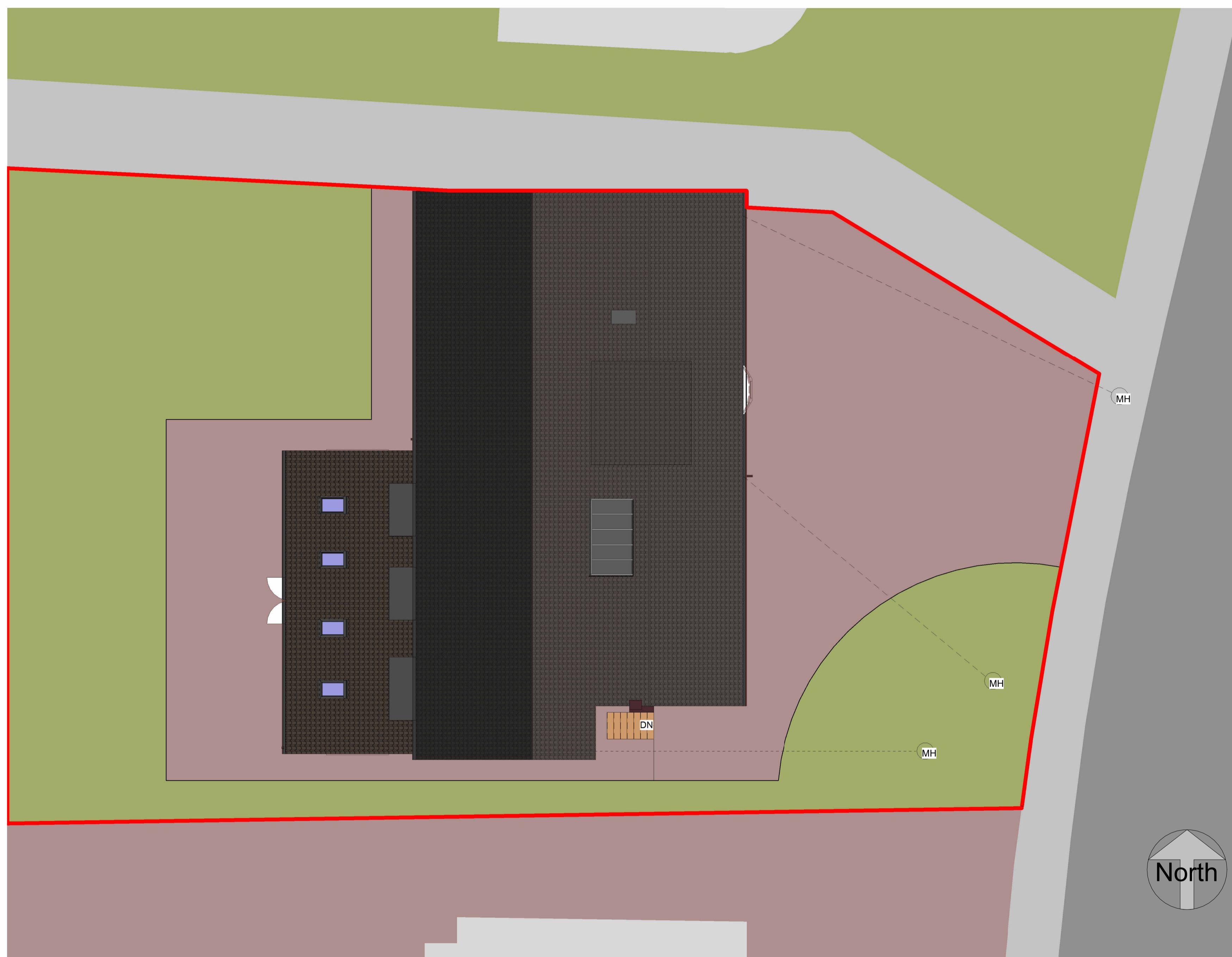
1:100 Existing Site Plan

NOTES Do not scale from this drawing. Only figured dimensions are to be taken from this drawing. Contractor must verify all dimensions on site before commencing any work or shop drawings. Report any discrepancies before commencing work to GW Architectural. If this drawing exceeds the quantities taken in any way the practice should be informed before the work is initiated. Work within the Construction (Design & Management) Regulations 2015 is not to start until a Construction Phase Plan has been produced. All work is to be carried out in accordance with good building practice and any relevant legislation, British Standards, Codes of Practice, etc, in force at the time of the execution of the works. This Drawing is Copyright and must not be reproduced without consent of GW Architectural