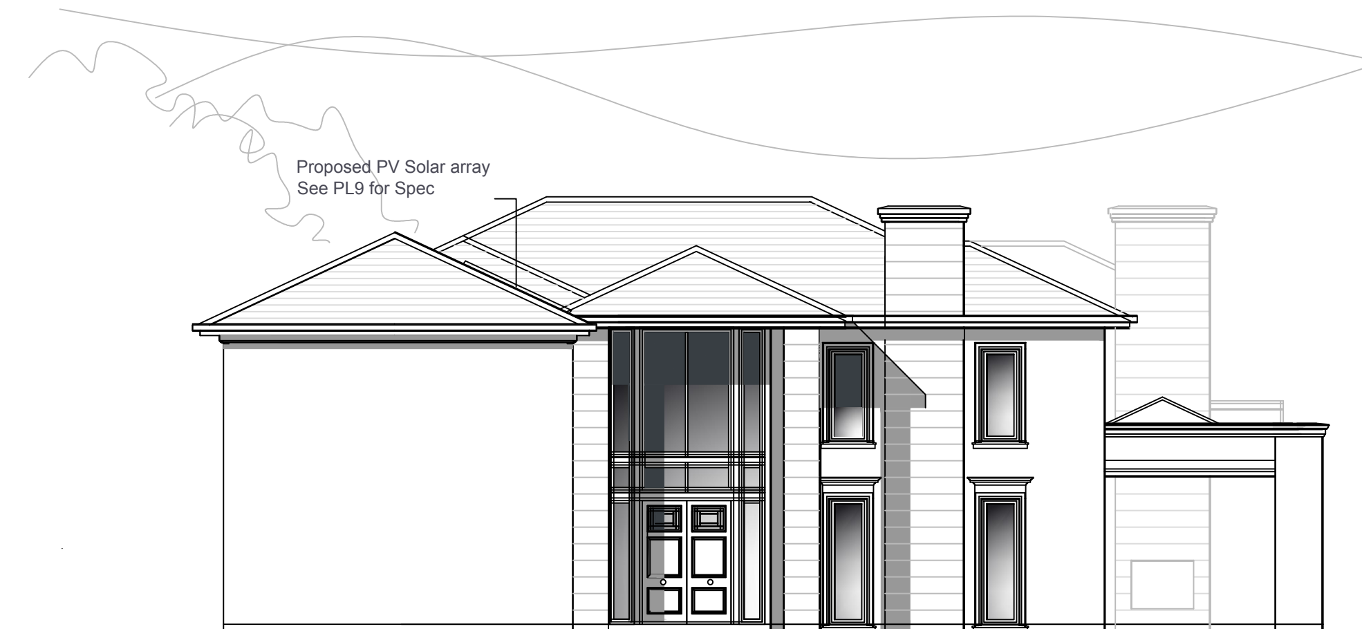
WEST (ENTRANCE) ELEVATION