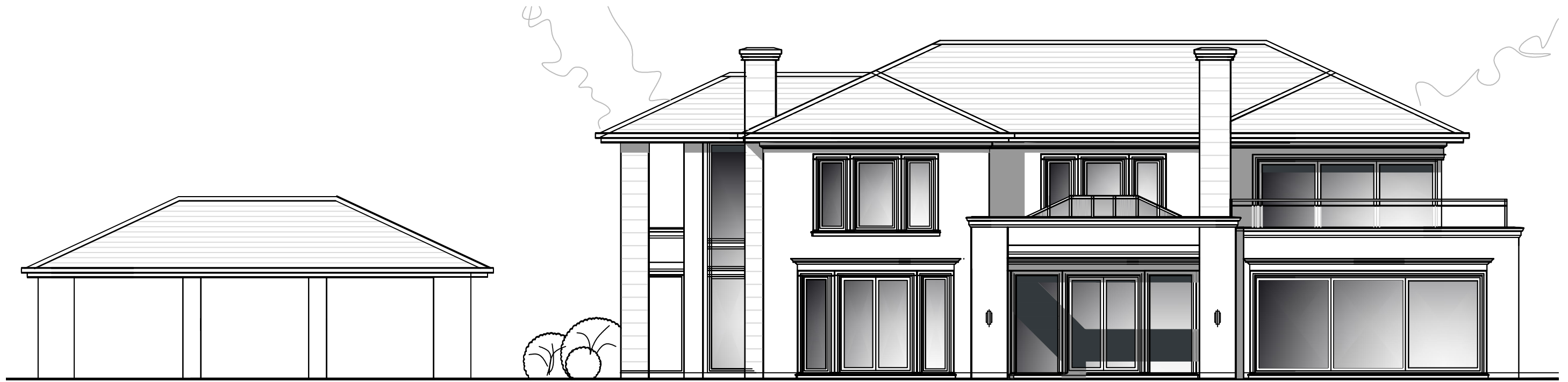
SOUTH (GARDEN) ELEVATION