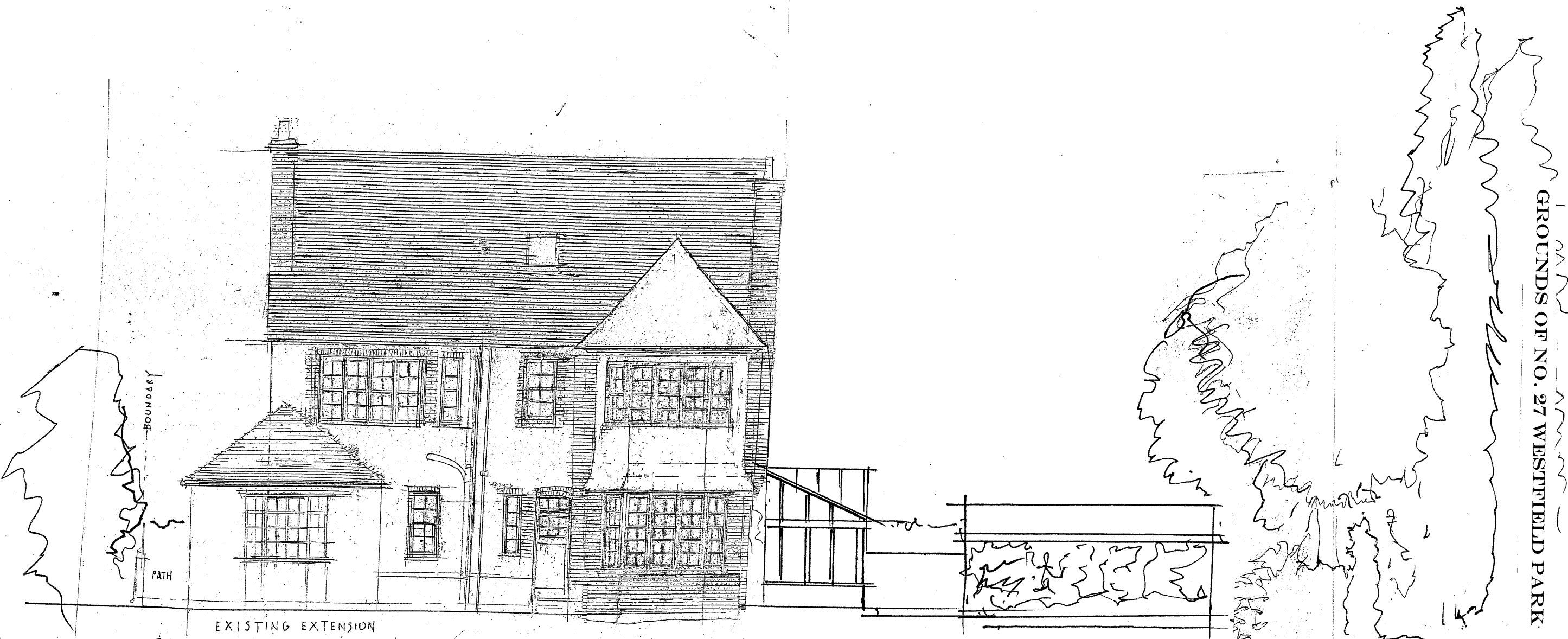
WEST ELEVATION AS EXISTING SCALE 1:100 @ A3

PROPOSED ALTERATIONS & EXTENSION TO LYNTON, 51 ELLOUGHTON ROAD, BROUGH, HU15 1AP AUGUST 2023 JOB NO. 2598 DRAWING NO. 7