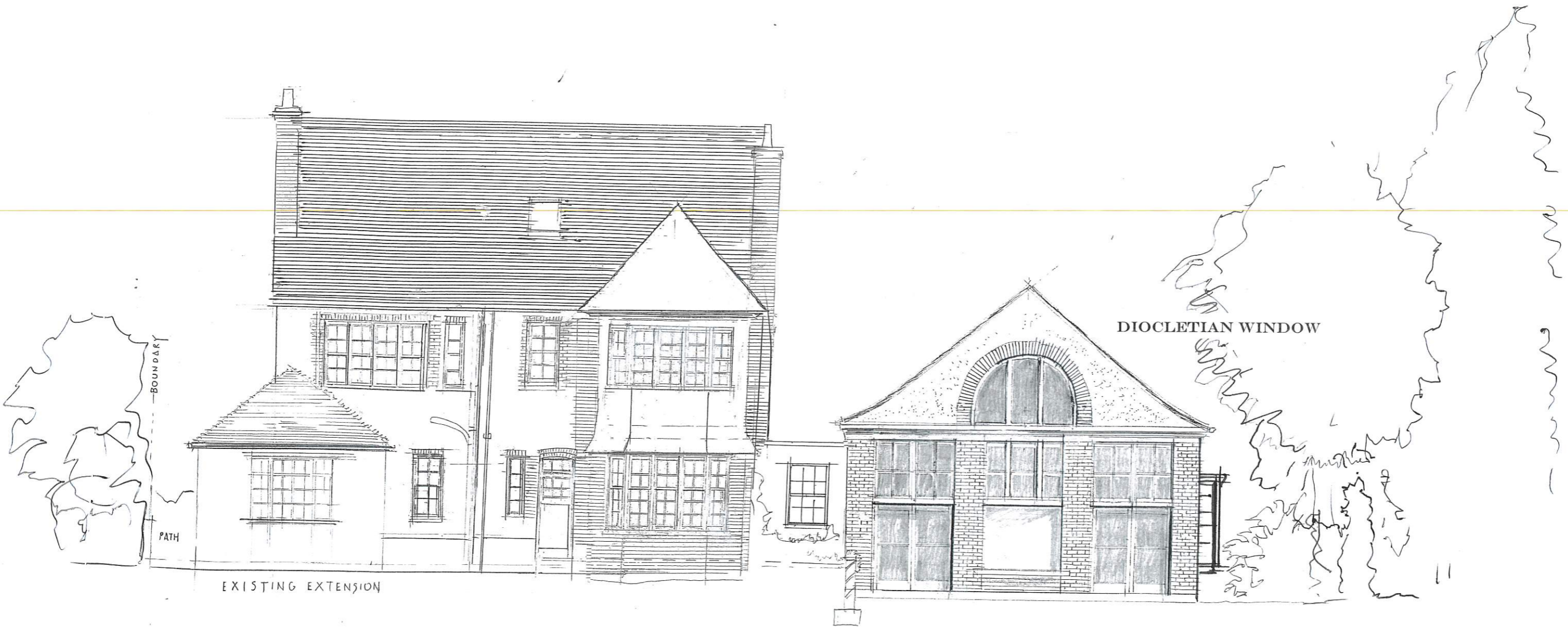
WEST ELEVATION AS PROPOSED SCALE 1:100 @ A3

PROPOSED ALTERATIONS & EXTENSION TO LYNTON, 51 ELLOUGHTON ROAD, BROUGH, HU15 1AP