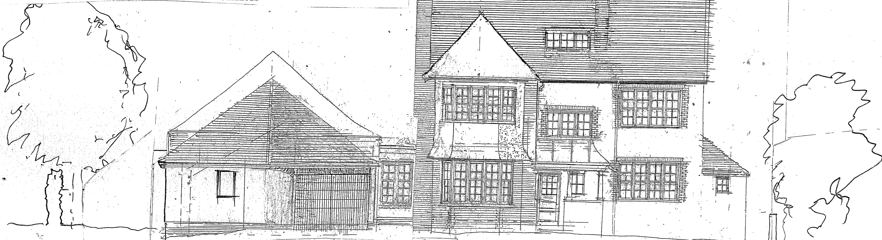
EAST ELEVATION AS EXISTING SCALE