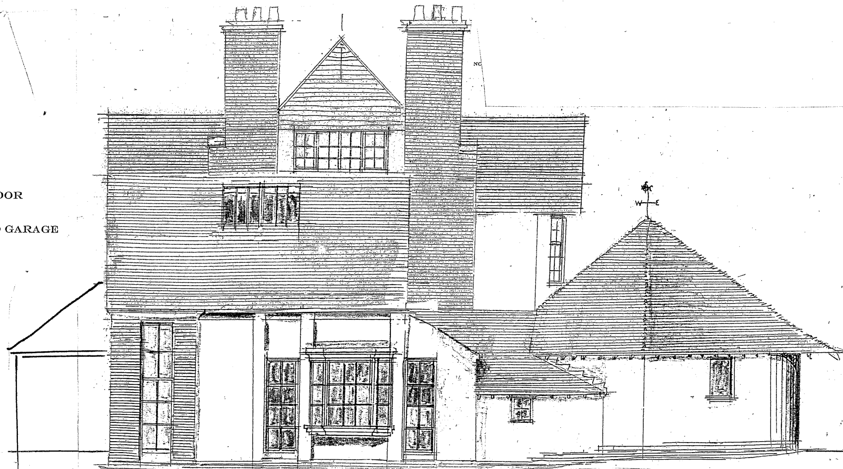
SOUTH ELEVATION AS PROPOSED SCALE 1:100 @ A3