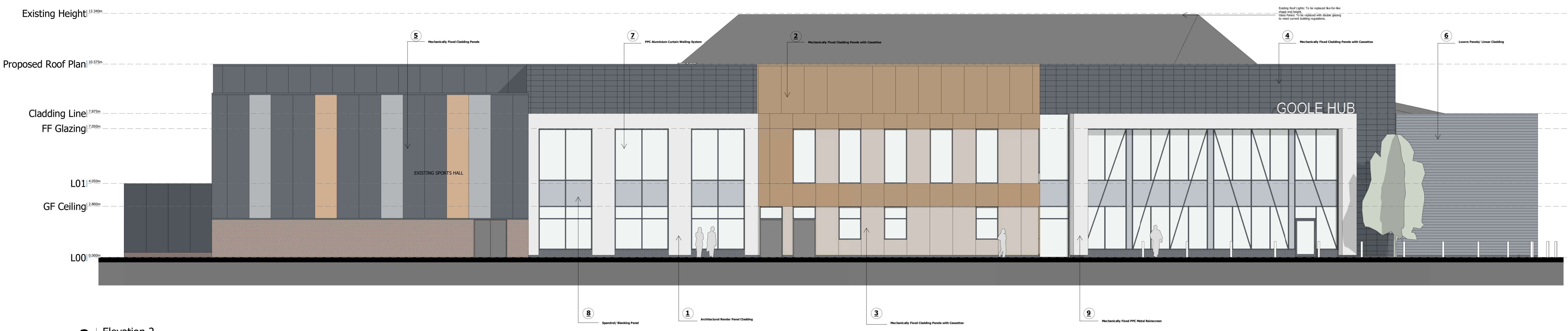
2 Elevation 2 1 : 100