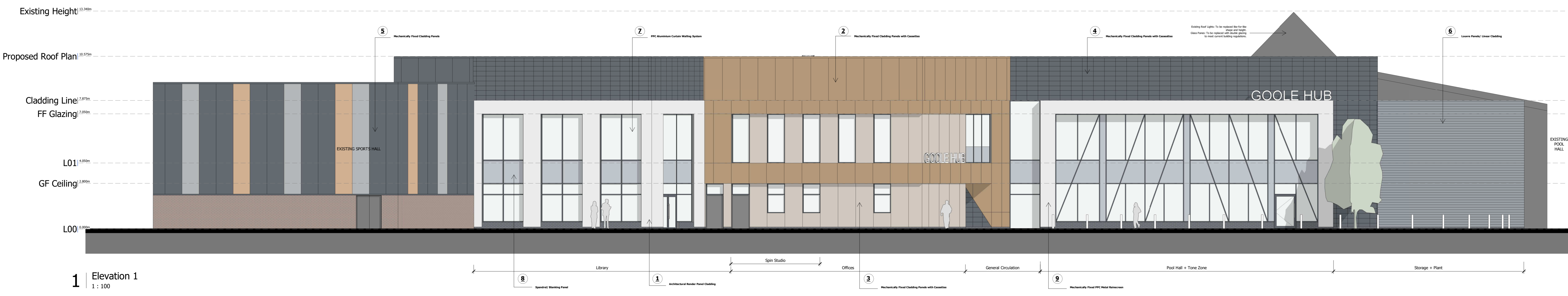
1 Elevation 1 1 : 100