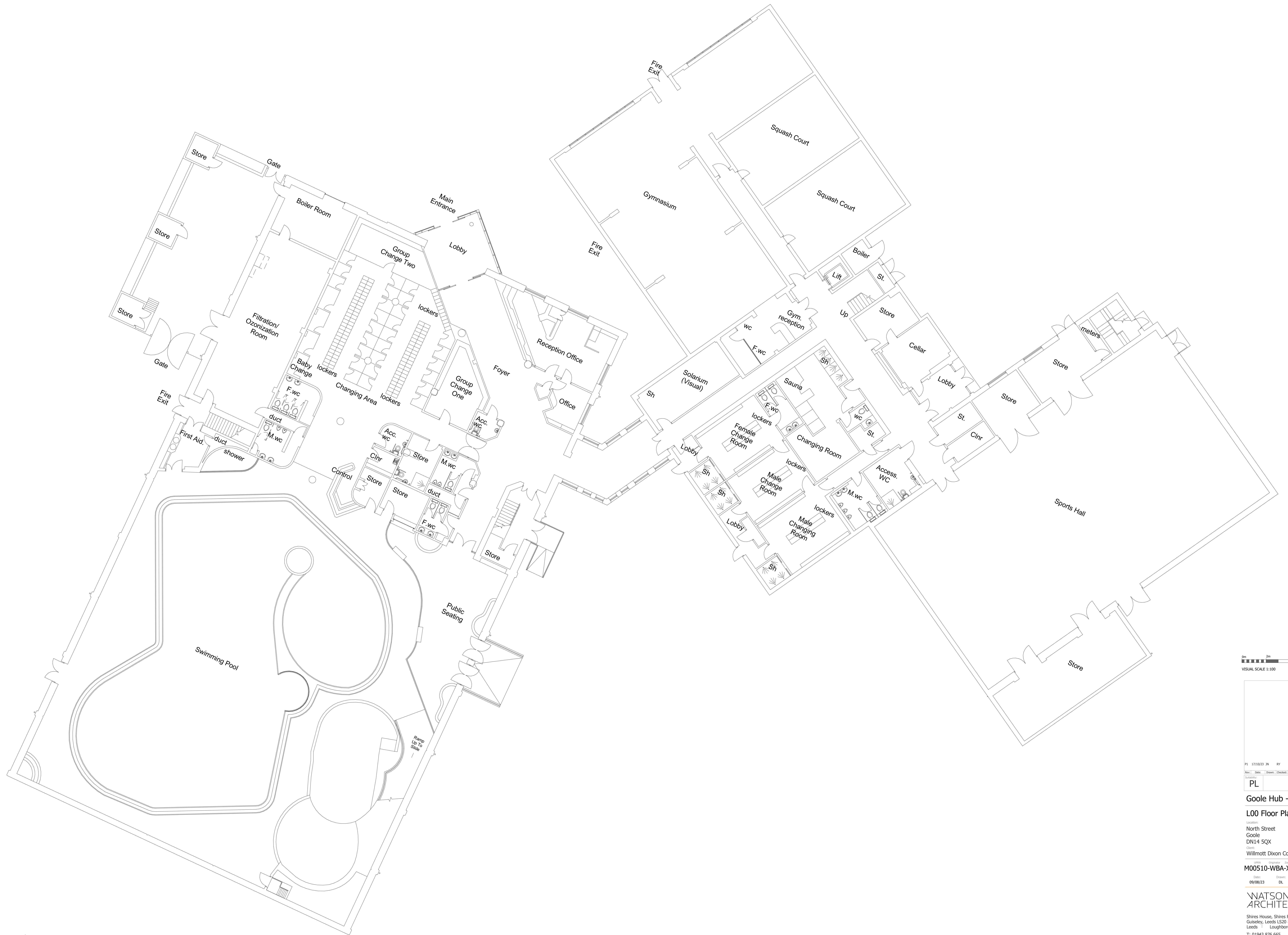
L00 - GF Existing Plan 1 : 100