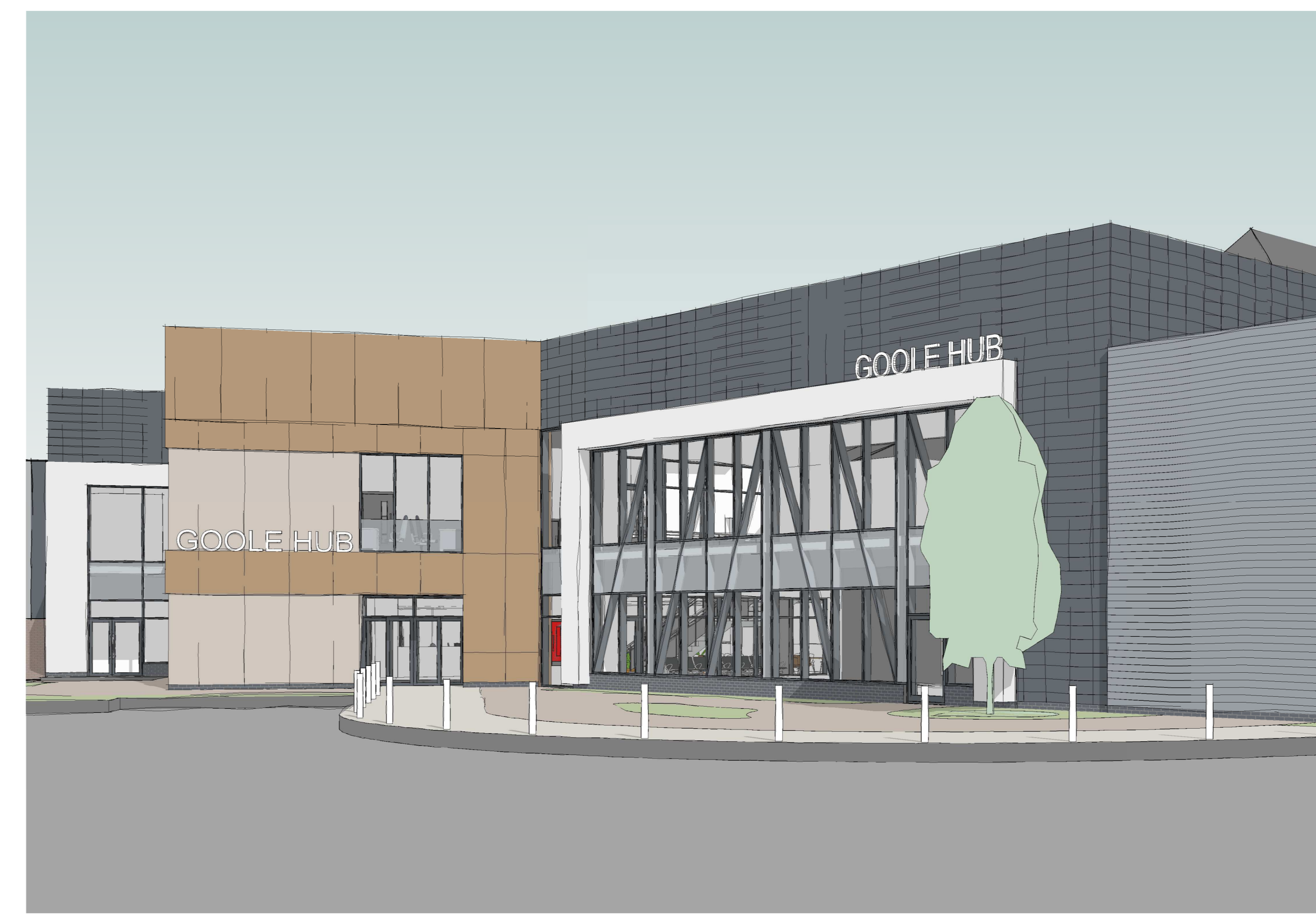
4 3D View 2