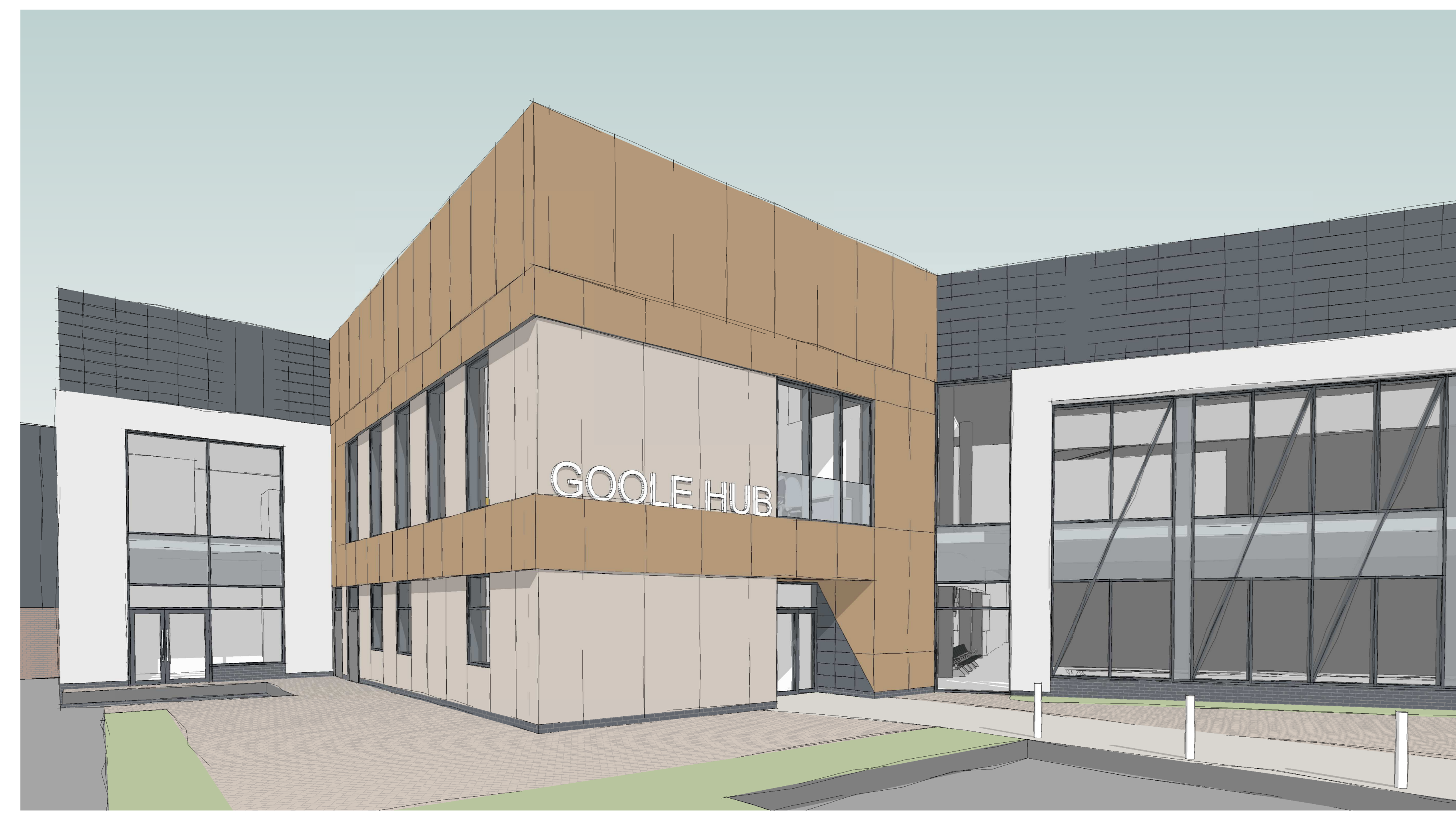
3 3D View 1