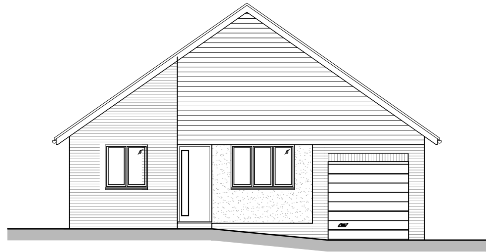
Existing North-West Elevation Scale 1:100

Notes. - Do not scale. - The contractor is responsible for checking dimensions, tolerances and references. Report all discrepancies before proceeding with the works. - Where an item is covered by drawings to different scales the larger scale drawing is to be worked to.