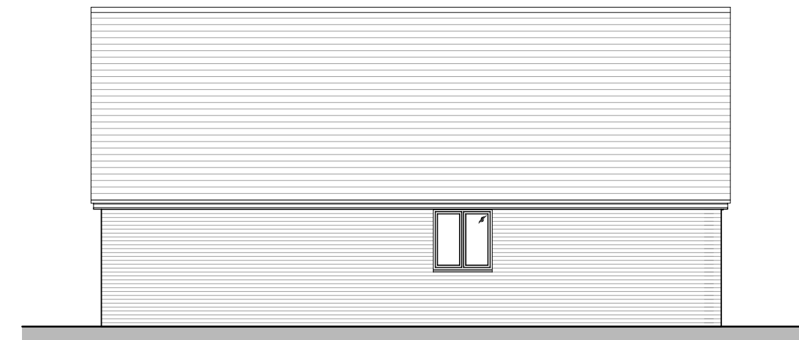
Existing North-East Elevation Scale 1:100