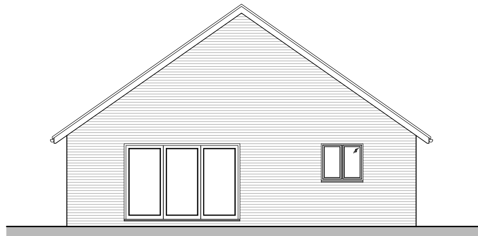
Existing South-East Elevation Scale 1:100