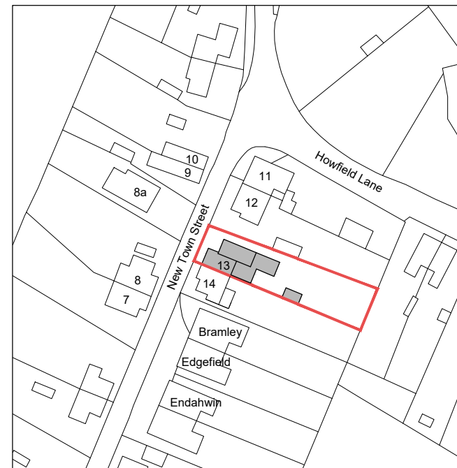
Existing Site Location Plan Scale 1:1250