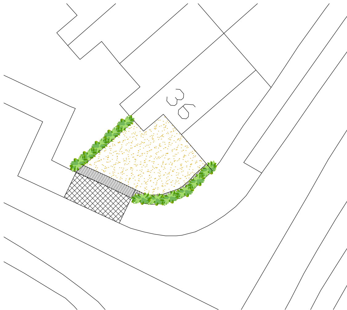
Site Plan As Prop. 1:200