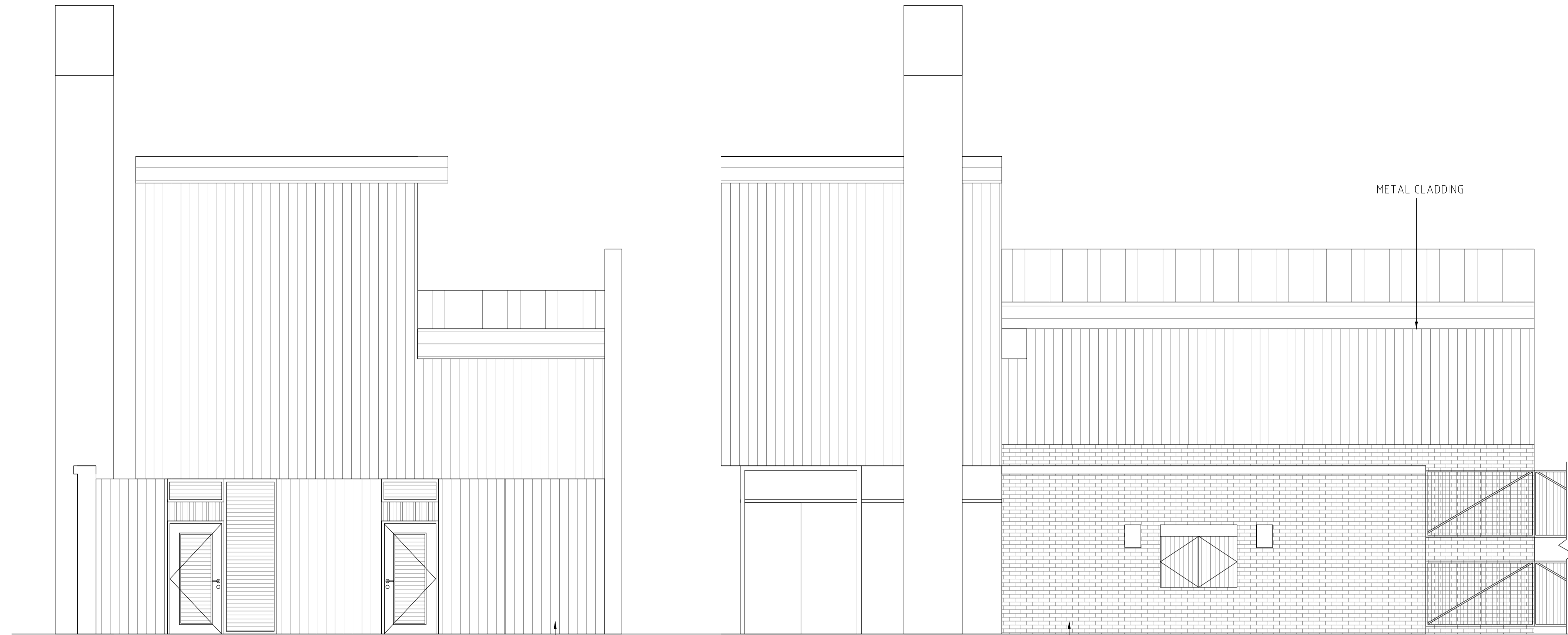
SIDE / SOUTH ELEVATION