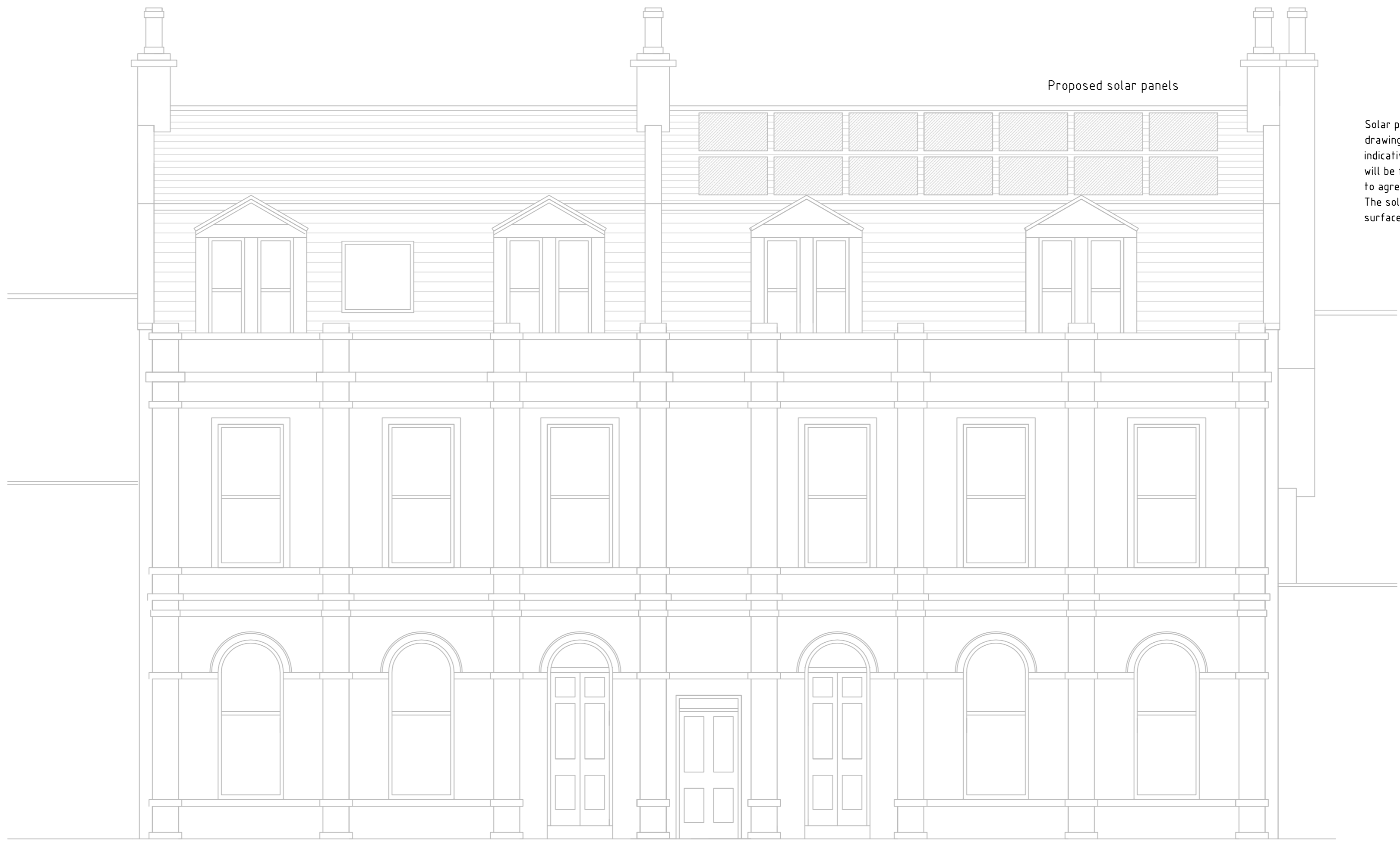
Proposed South Elevation

Solar panel layout shown on this drawing should be regarded as indicative at this stage. The layout will be finalised by the installer, subject to agreement with the planning officials. The solar panels are to have a plain black surface with black rims.