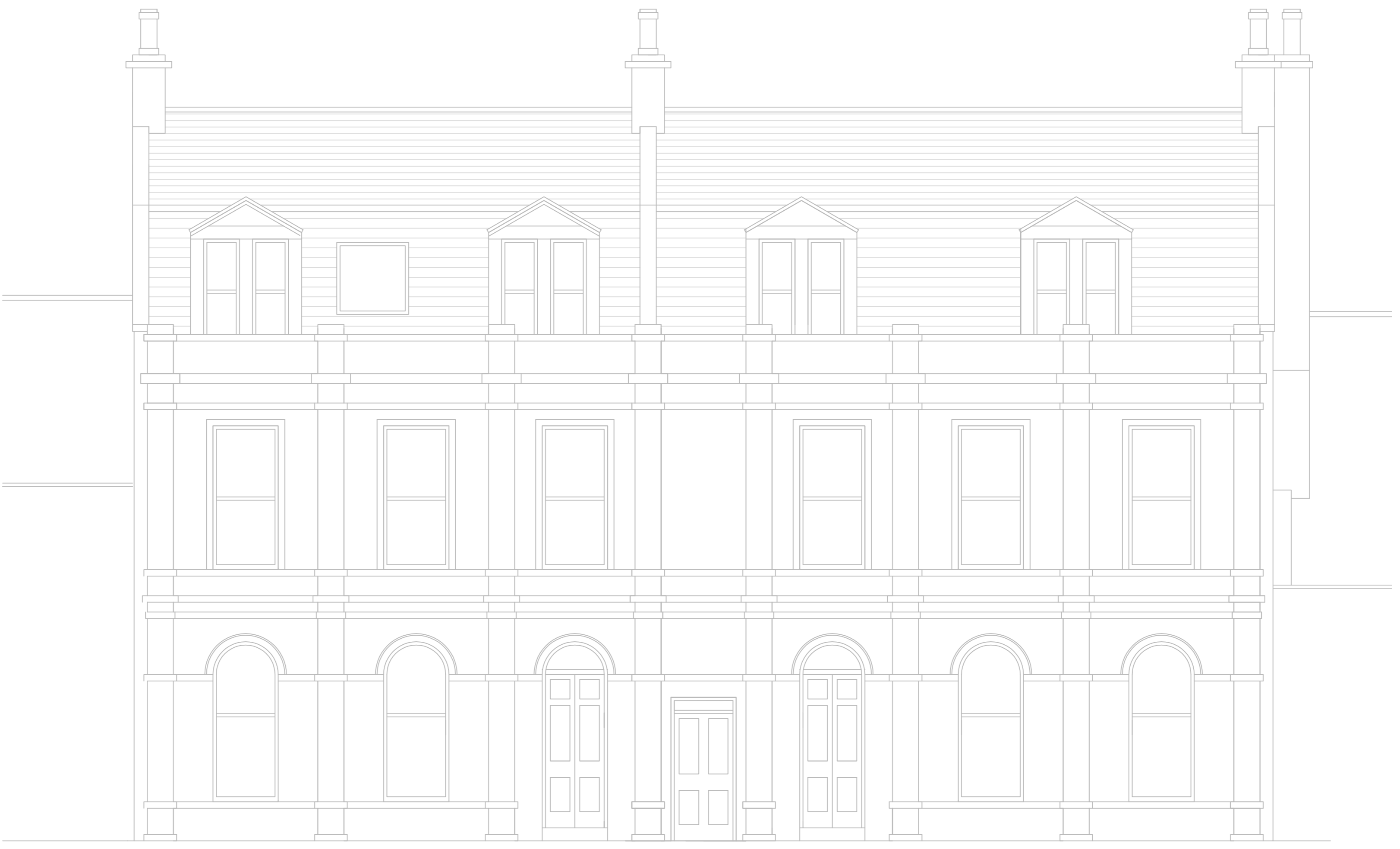
Existing South Elevation

Solar panel layout shown on this drawing should be regarded as indicative at this stage. The layout will be finalised by the installer, subject to agreement with the planning officials. The solar panels are to have a plain black surface with black rims.