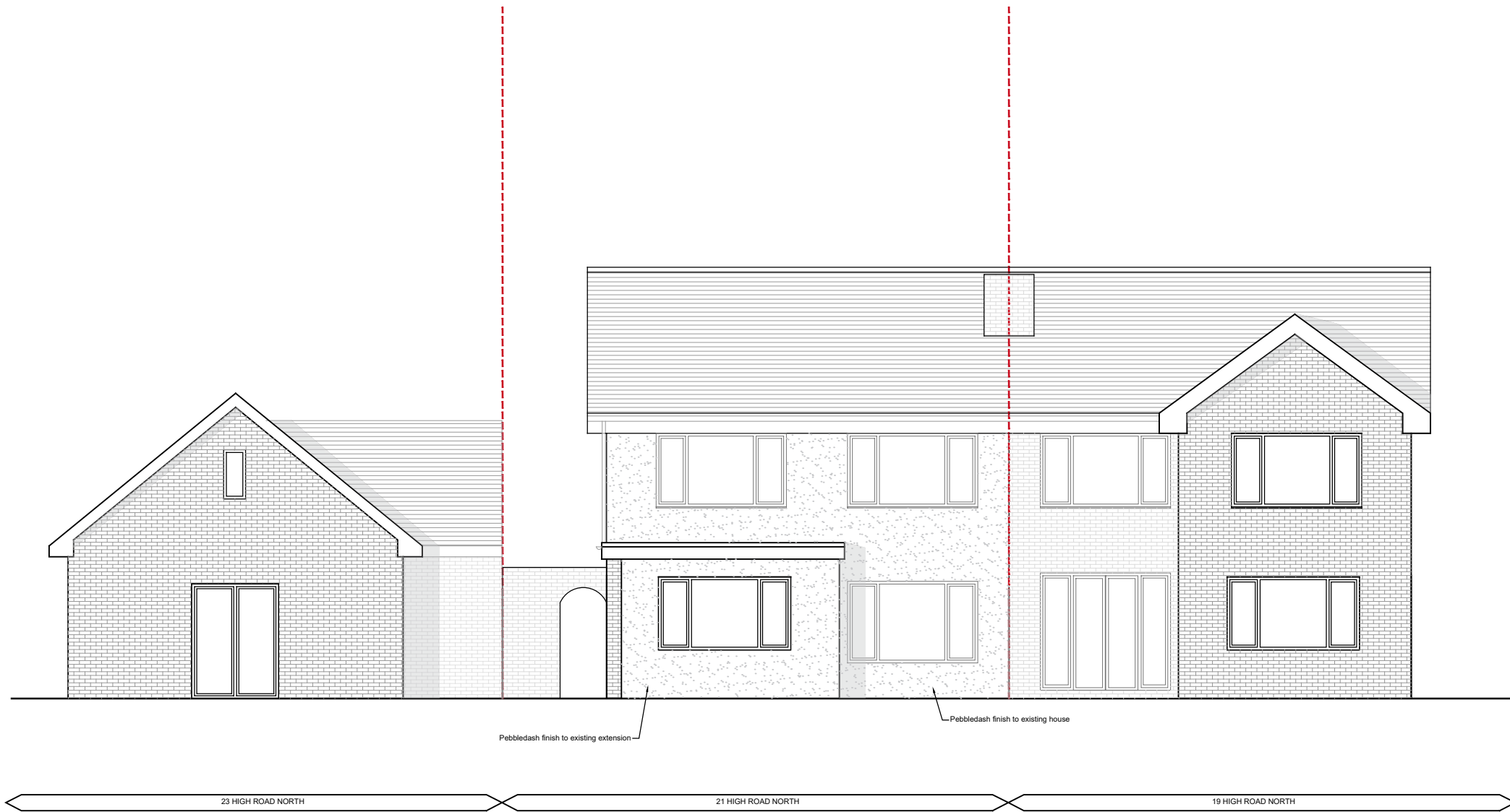
EXISTING REAR ELEVATION - 1:100