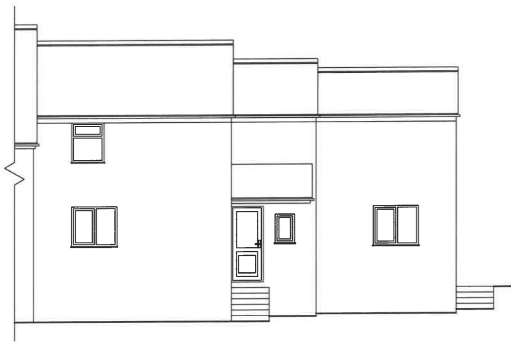
FRONT ELEVATIONS 1:100