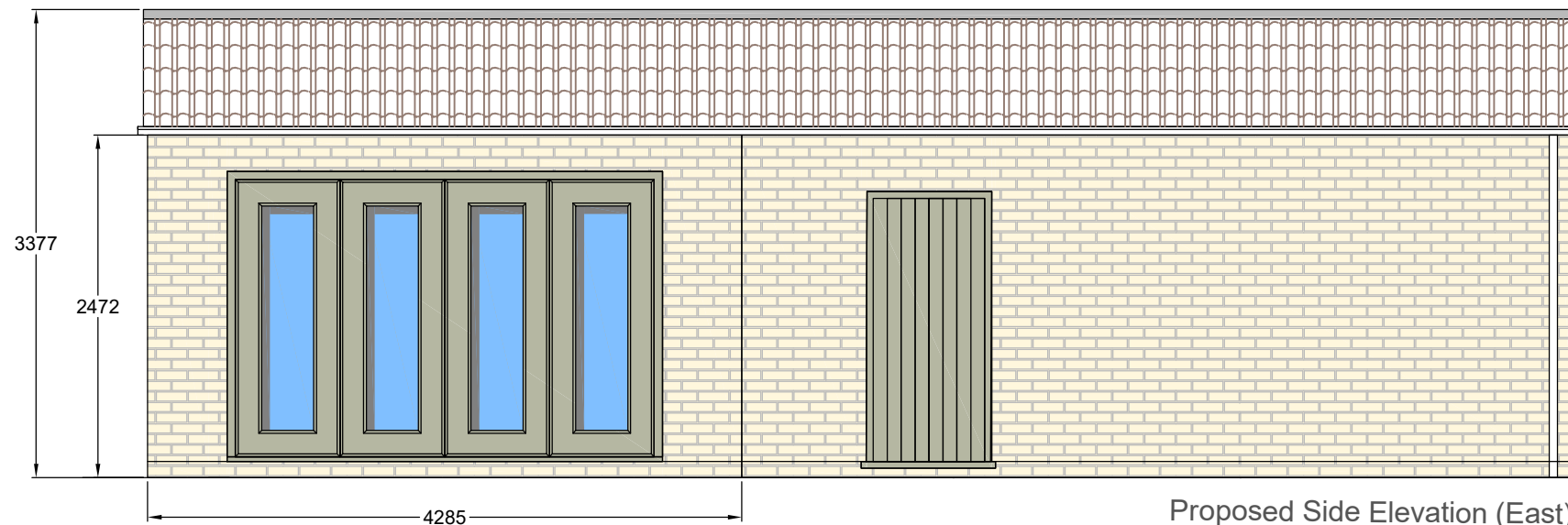
Proposed Side Elevation (East)

1 Museum Cottage Main Street Southwick Peterborough PE8 5BL t. 01832 274577 m. 07967 272 668 info@OptimumDesignServices.co.uk www.optimumdesignservices.co.uk