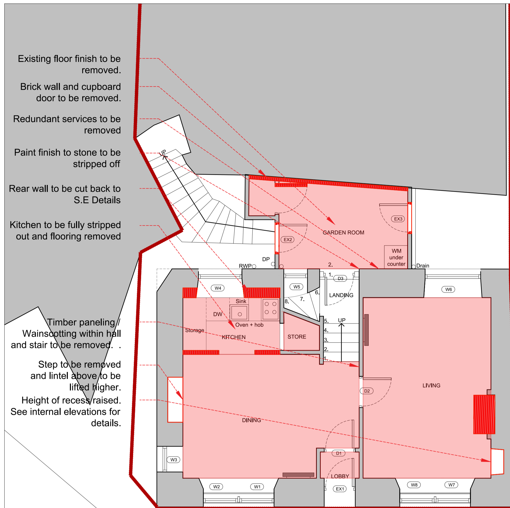
1 PROPOSED GROUND FLOOR DEMOLITIONS Scale: 1:50