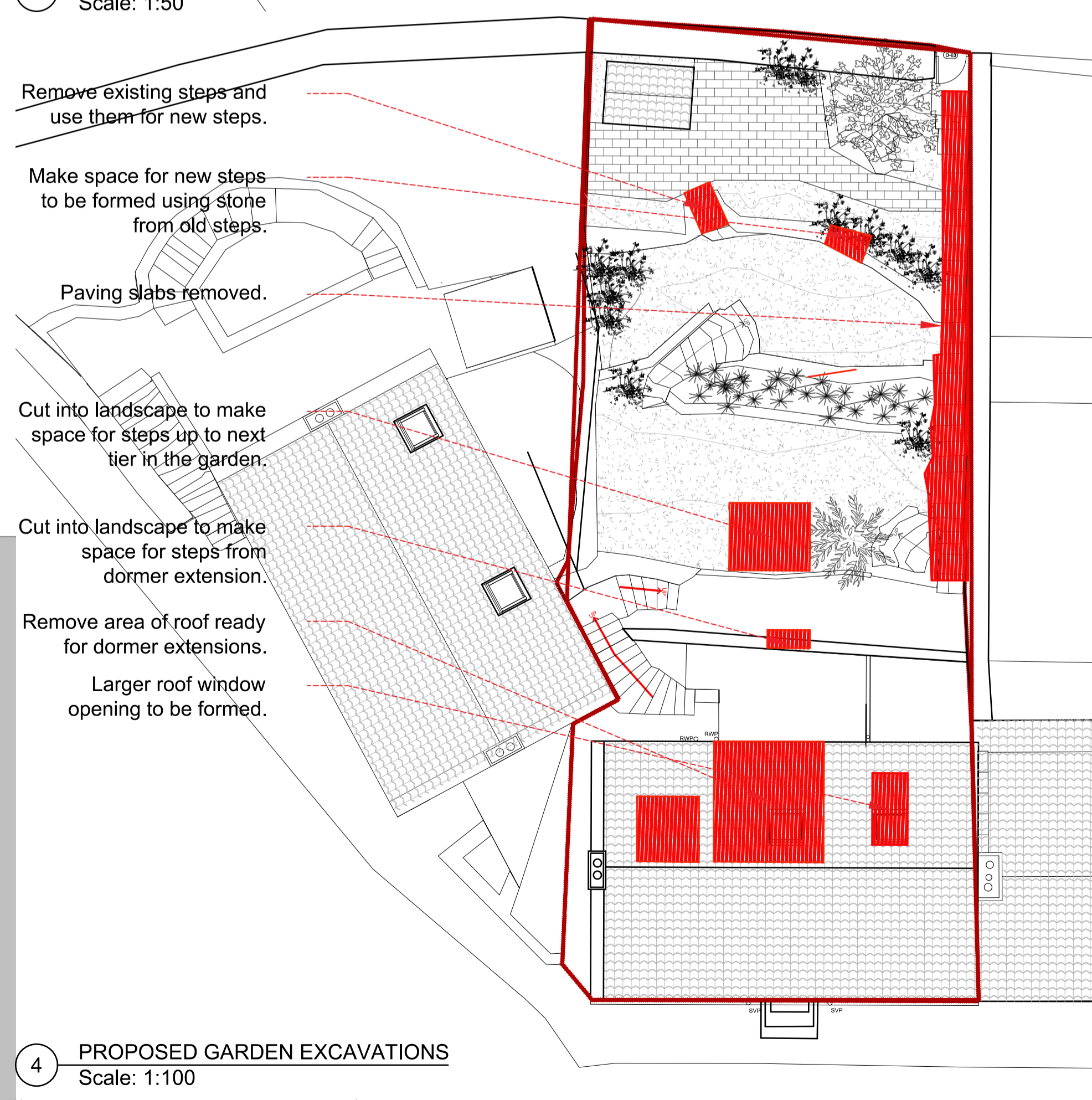
4 PROPOSED GARDEN EXCAVATIONS Scale: 1:100