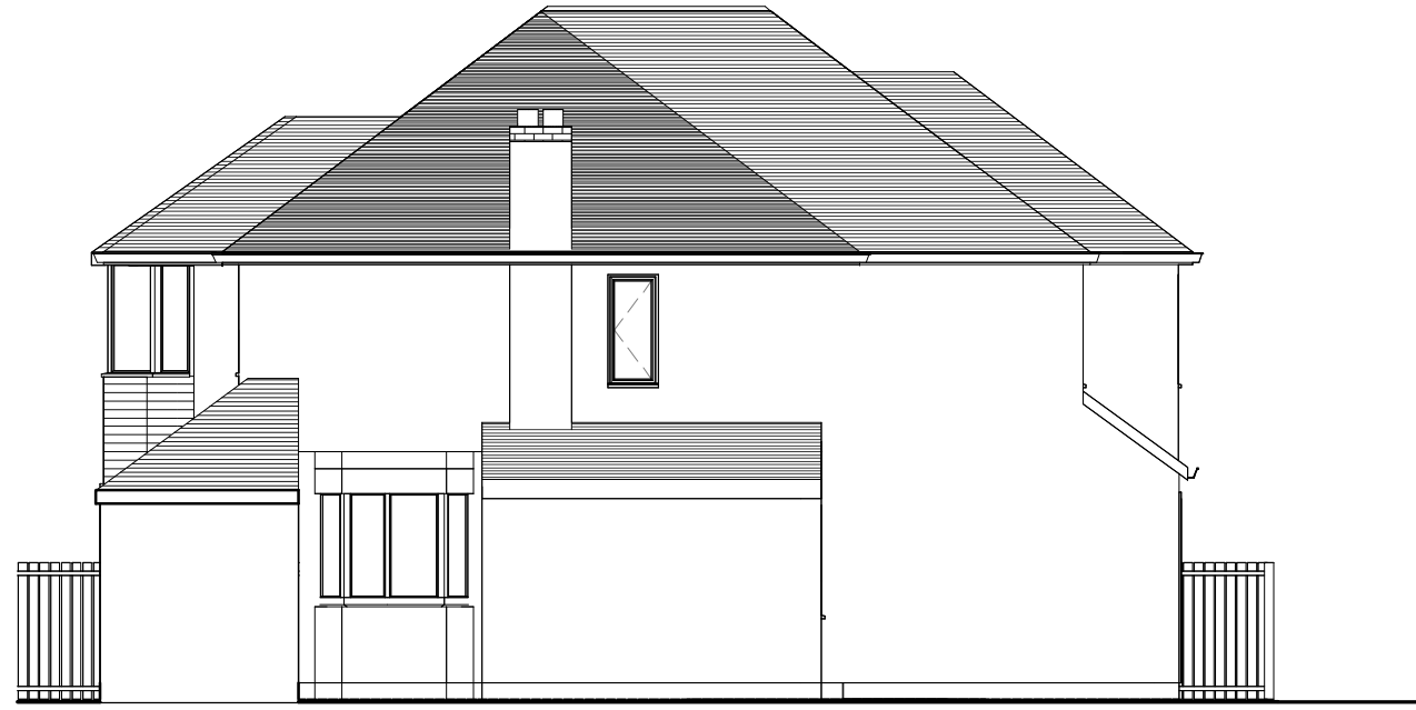
Proposed Side Elevation 1 : 100

Obscured Glazed windows to be provided to the Gable End, Fixed up to 1.7m from the finished floor level.