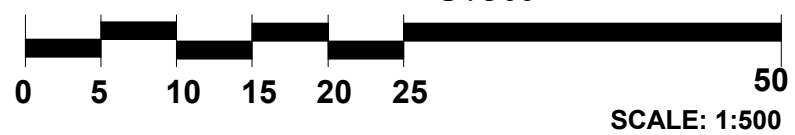
Block Plan 1 : 500

THIS DESIGN IS COPYRIGHT AND MUST NOT BE REPRODUCED WITHOUT WRITTEN CONSENT FROM RAOCON LTD.