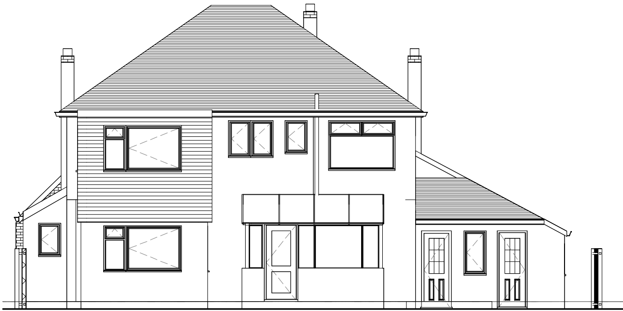
Existing Rear Elevation 1 : 100