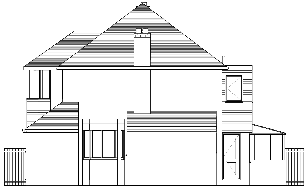
Existing Side Elevation 1 : 100