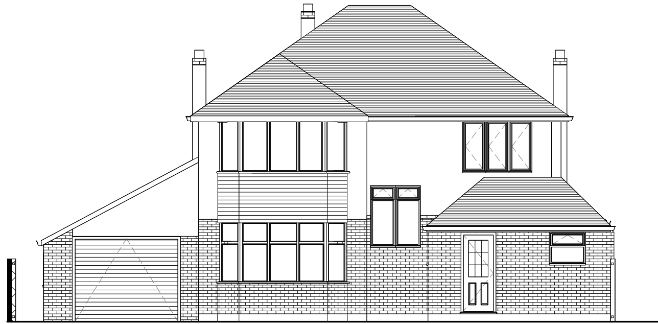
Existing Front Elevation 1 : 100