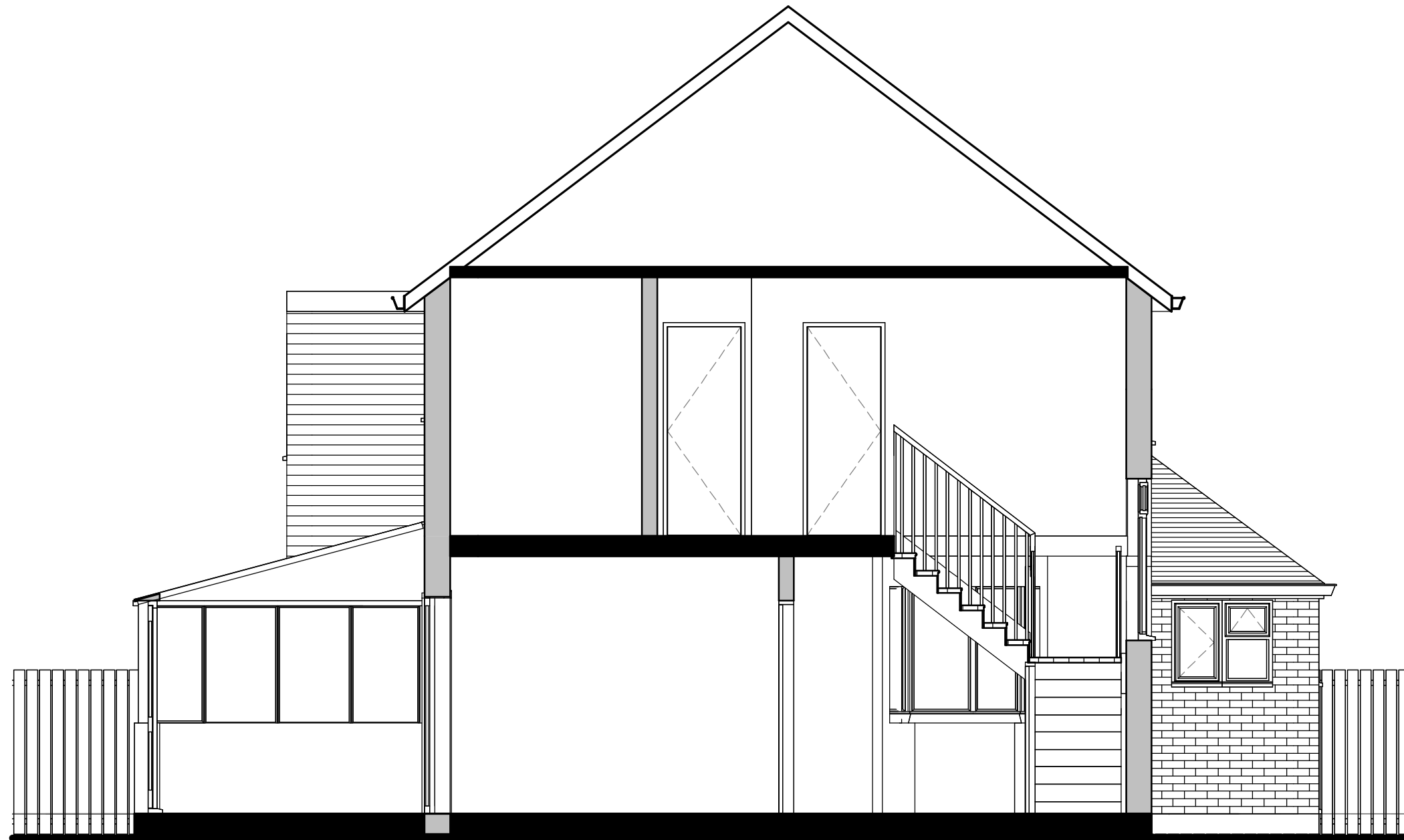
Existing Section A-A 1 : 50

ANY WORK COMMENCING BEFORE APPROVALS HAVE GRANTED IS AT THE RISK OF THE CLIENT AND THE BUILDER..