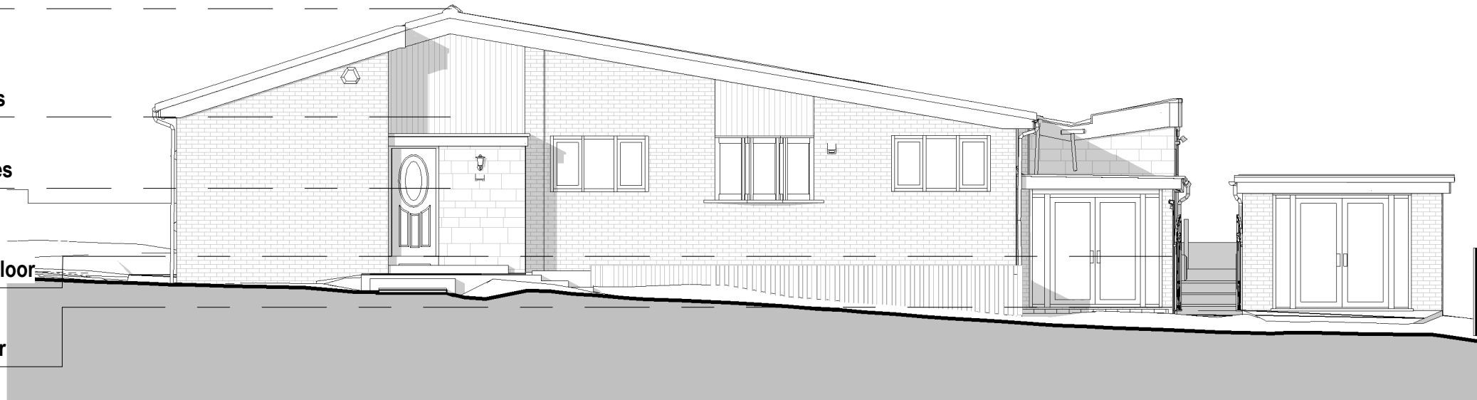
1 Front Elevation (Existing) 1 : 100