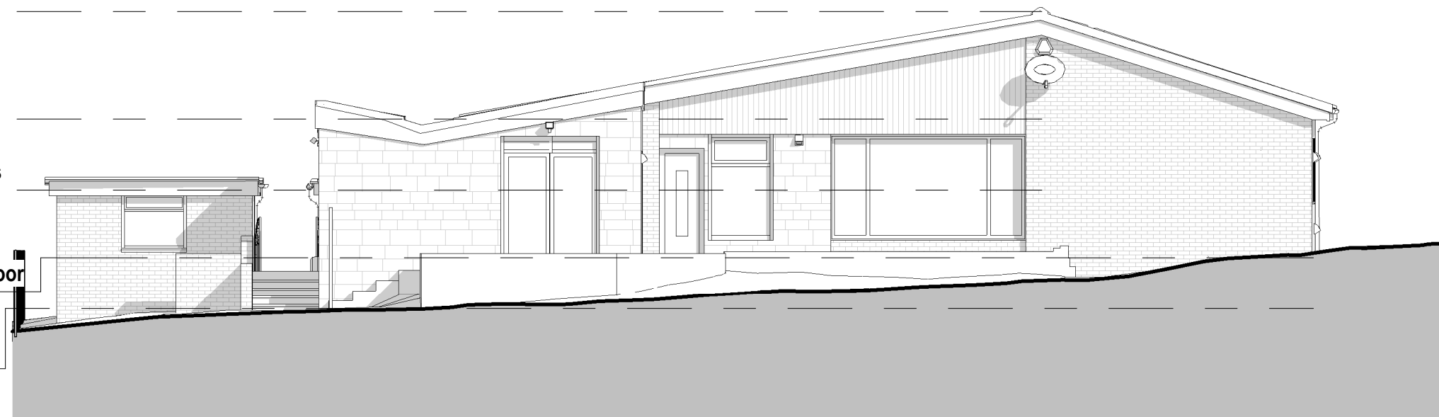
2 Rear Elevation (Existing) 1 : 100