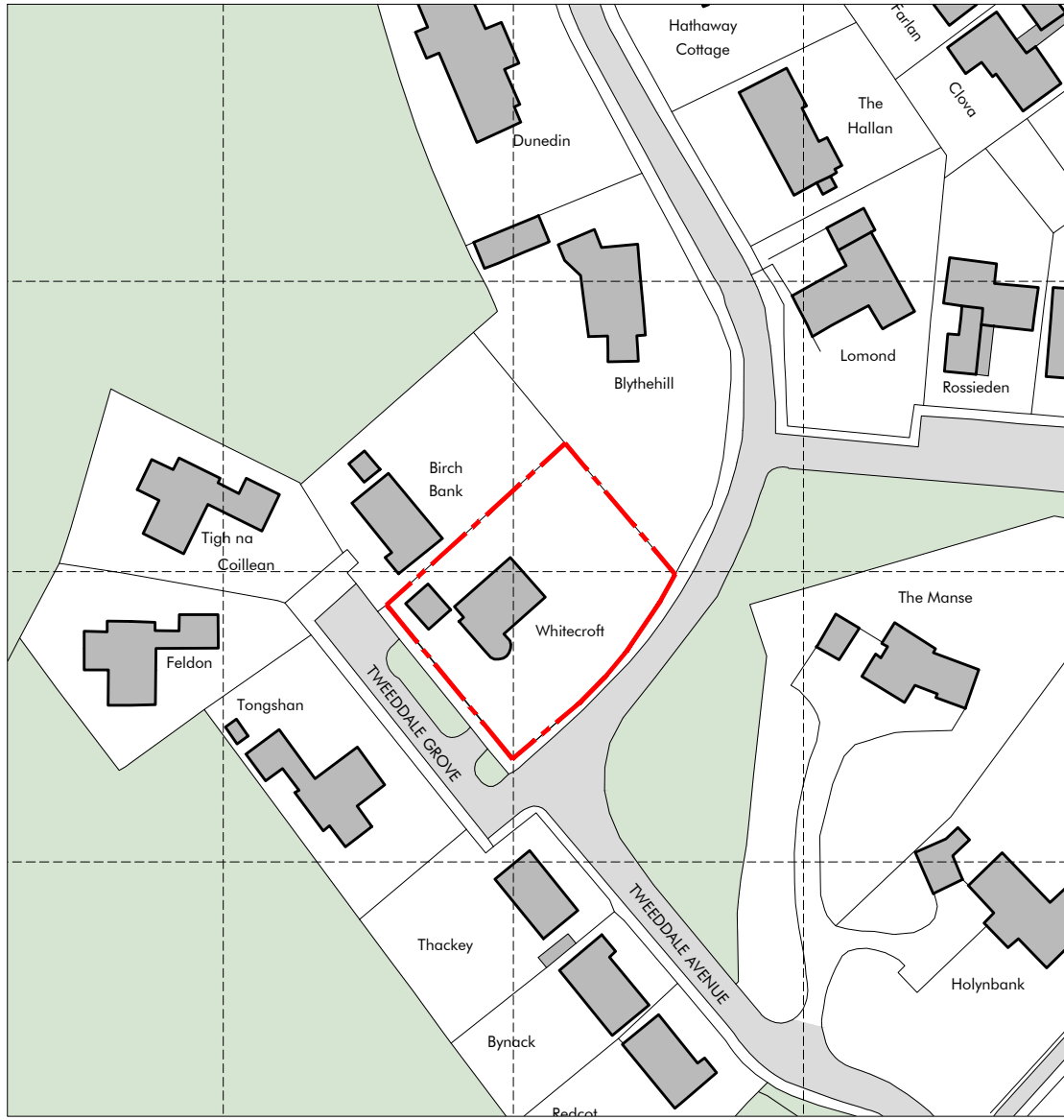
LOCATION PLAN SCALE 1:1250 @ A3