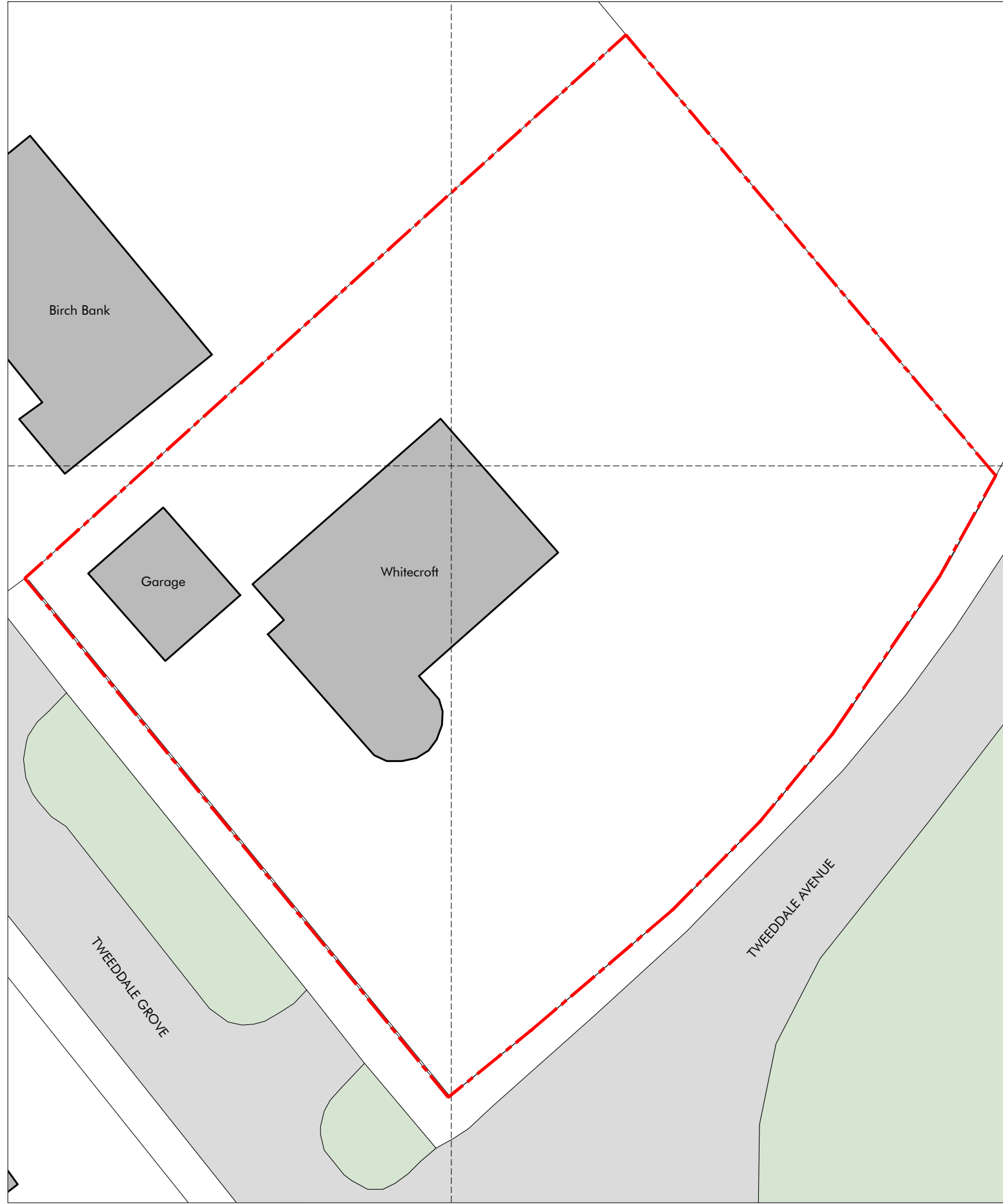
SITE PLAN SCALE 1:250 @ A3