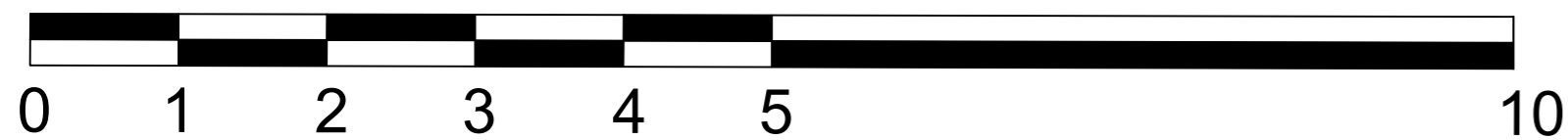
SCALE BAR 1:50