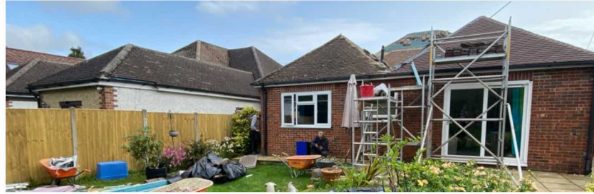
Built Context - 130 Old Kempshott Lane - Single storey

Permission to erect single storey extension to existing property. To provide essential accessible DDA living facilities with access to garden.