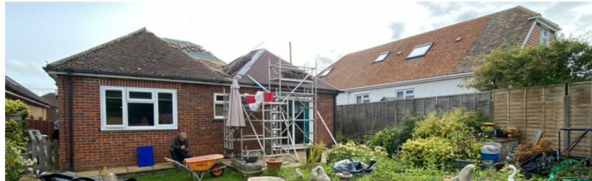
Built Context - 134 Old Kempshott Lane - Two storey

Construction and alteration to below ground drainage to be in accordance and subject to Building Control review inspection and approval.