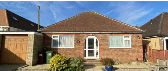
Built Context - 132 Old Kempshott Lane - Single storey