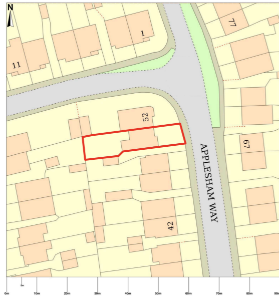
1 location plan 1:1250