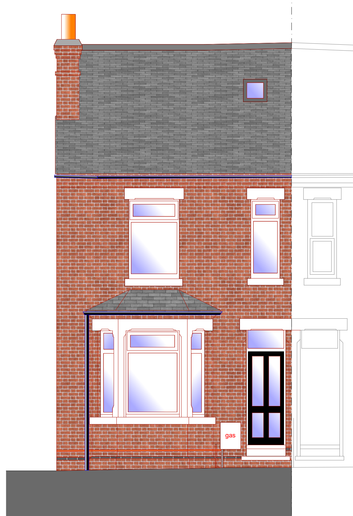
EXISTING REAR (North) Elevation 1:50