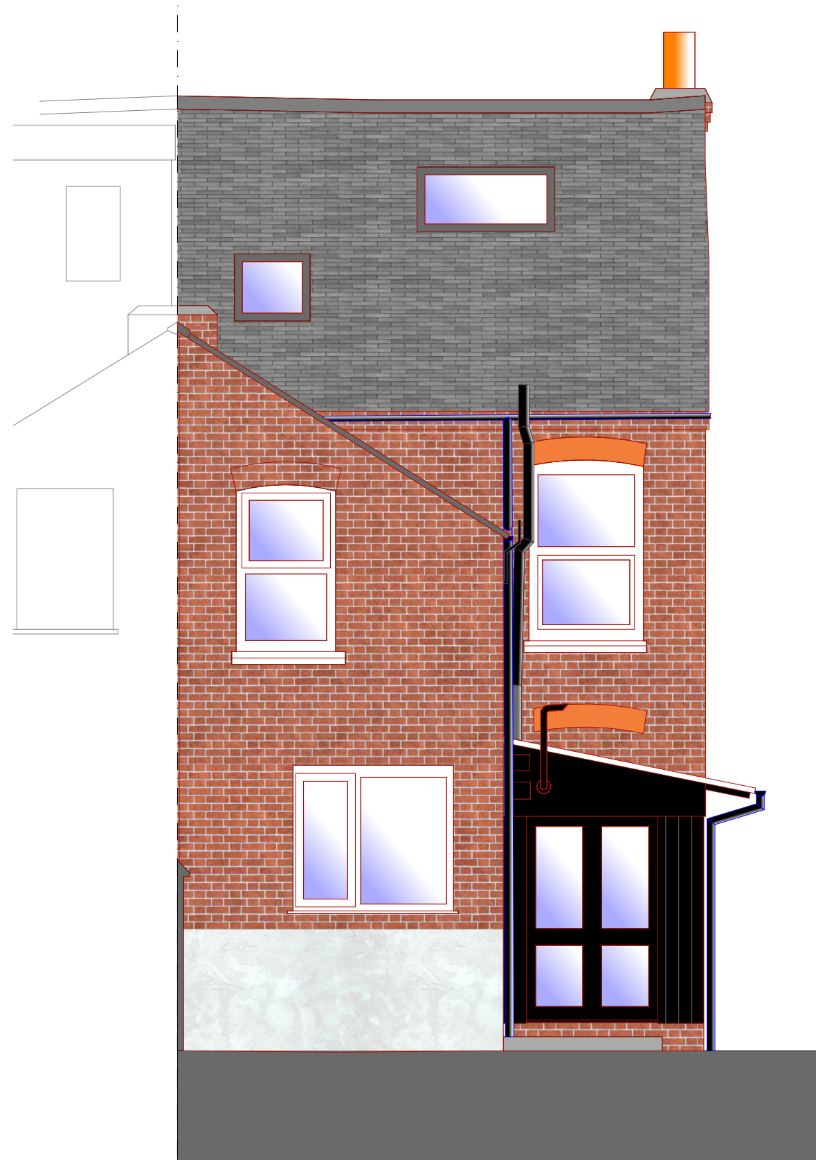
EXISTING REAR (North) Elevation 1:50