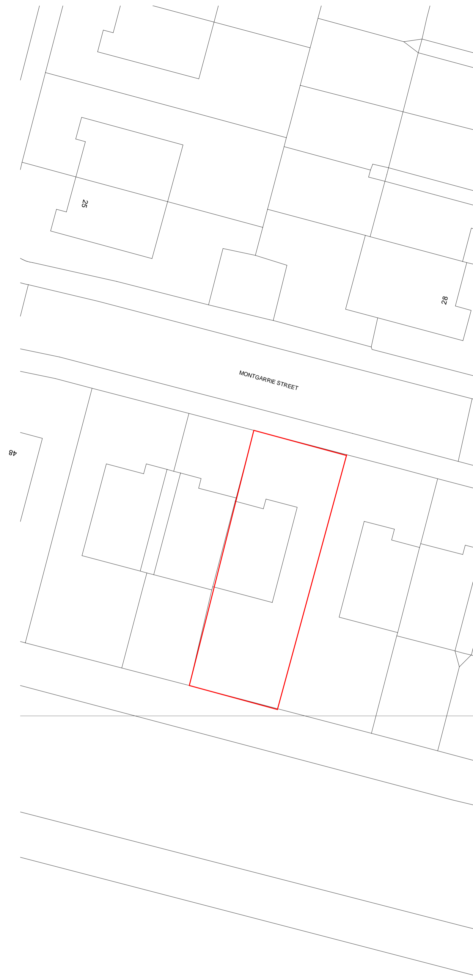
Existing Site Plan 1 : 200