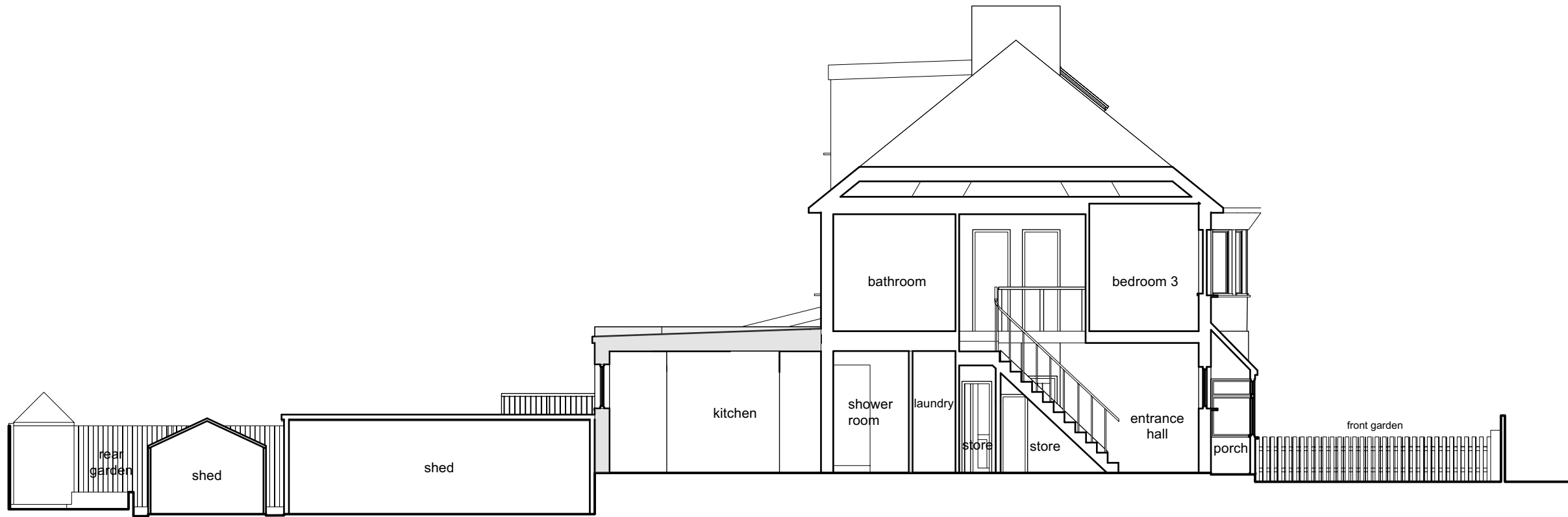
Proposed Section A - A

Notes: The contractor is responsible for checking all dimensions before work starts. Any discrepancies to be brought to the attention of the Architect immediately. The contractor is responsible for checking all dimensions before work starts.