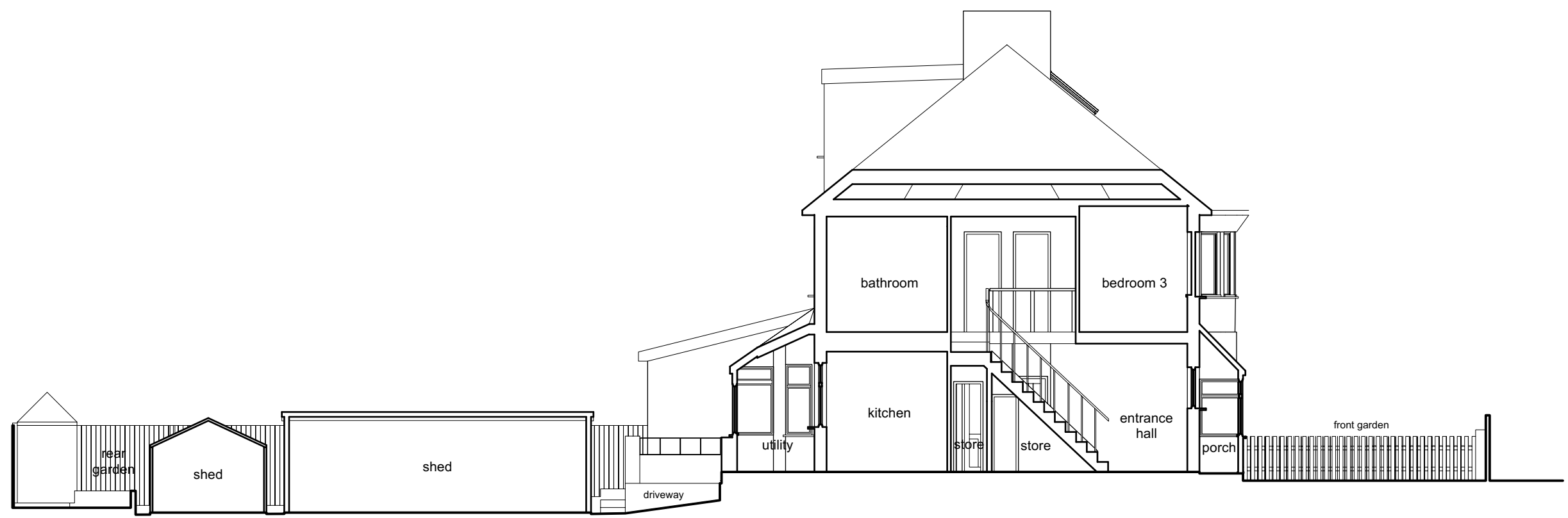
Existing Section A - A

Notes: The contractor is responsible for checking all dimensions before work starts. Any discrepancies to be brought to the attention of the Architect immediately. The contractor is responsible for checking all dimensions before work starts.