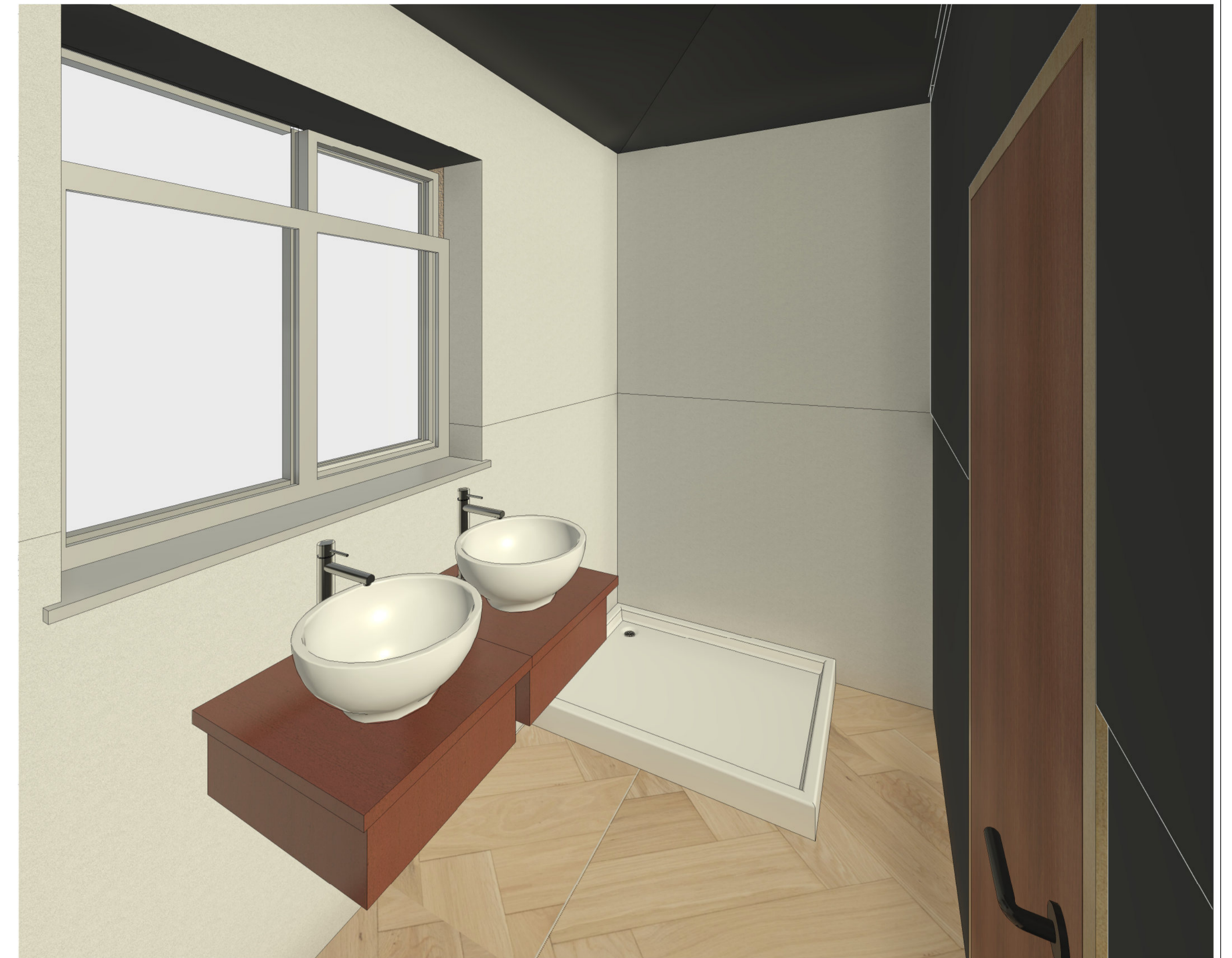
3 INTERNAL EN-SUITE