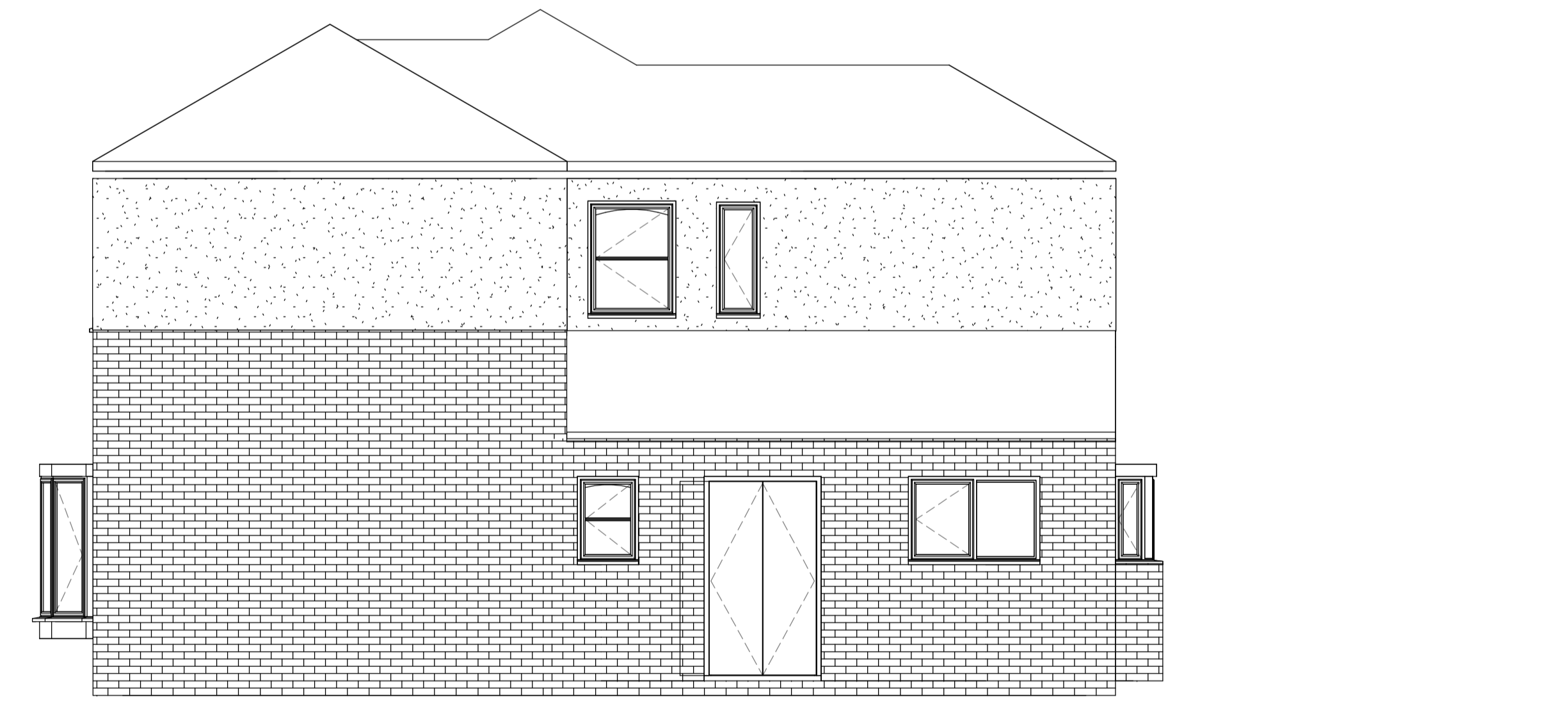
4 EXISTING REAR ELEVATION 1 : 50