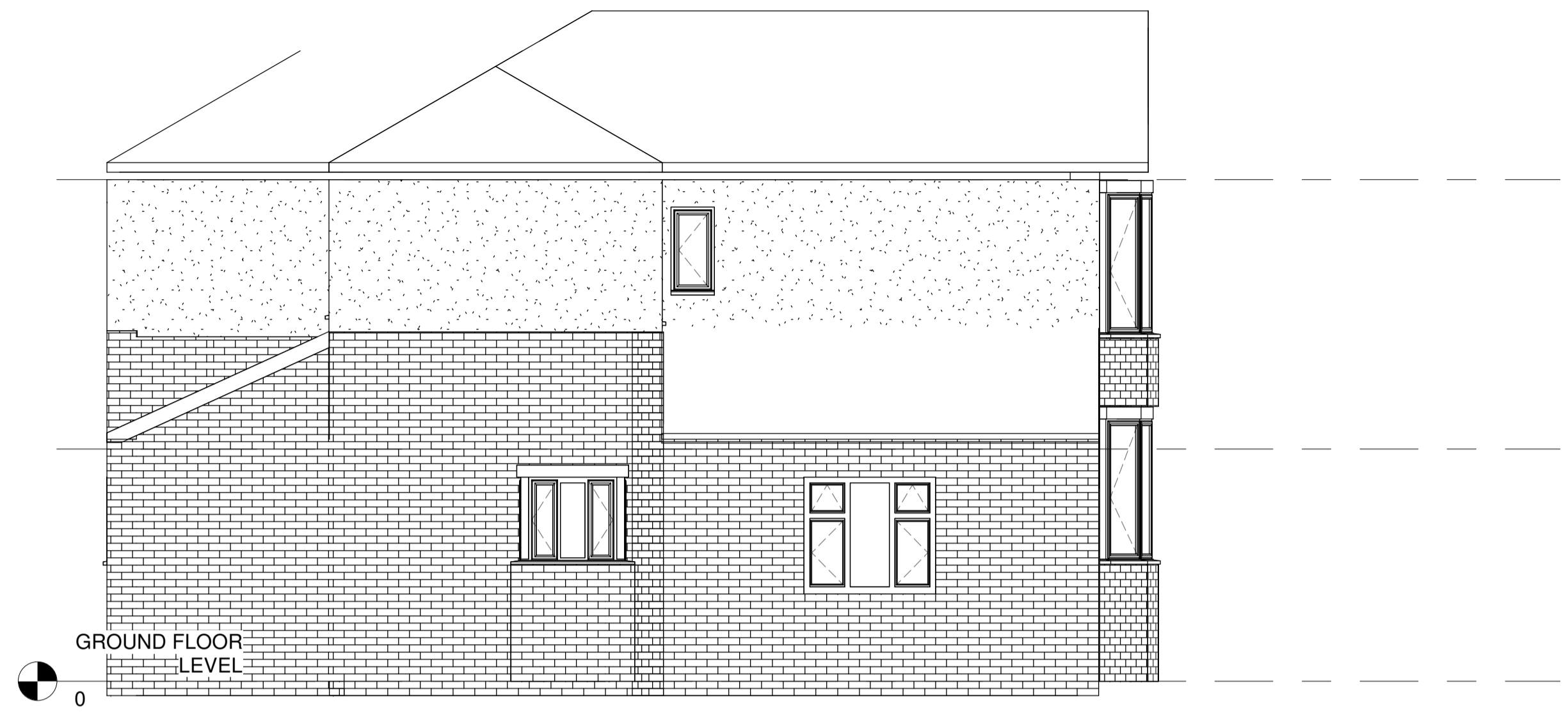
1 EXISTING SIDE ELEVATION 2 1 : 50