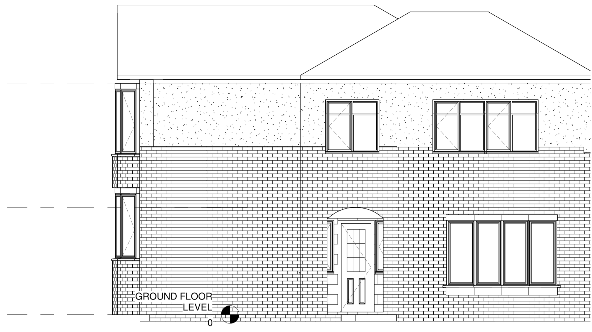
2 EXISTING FRONT ELEVATION 1 : 50