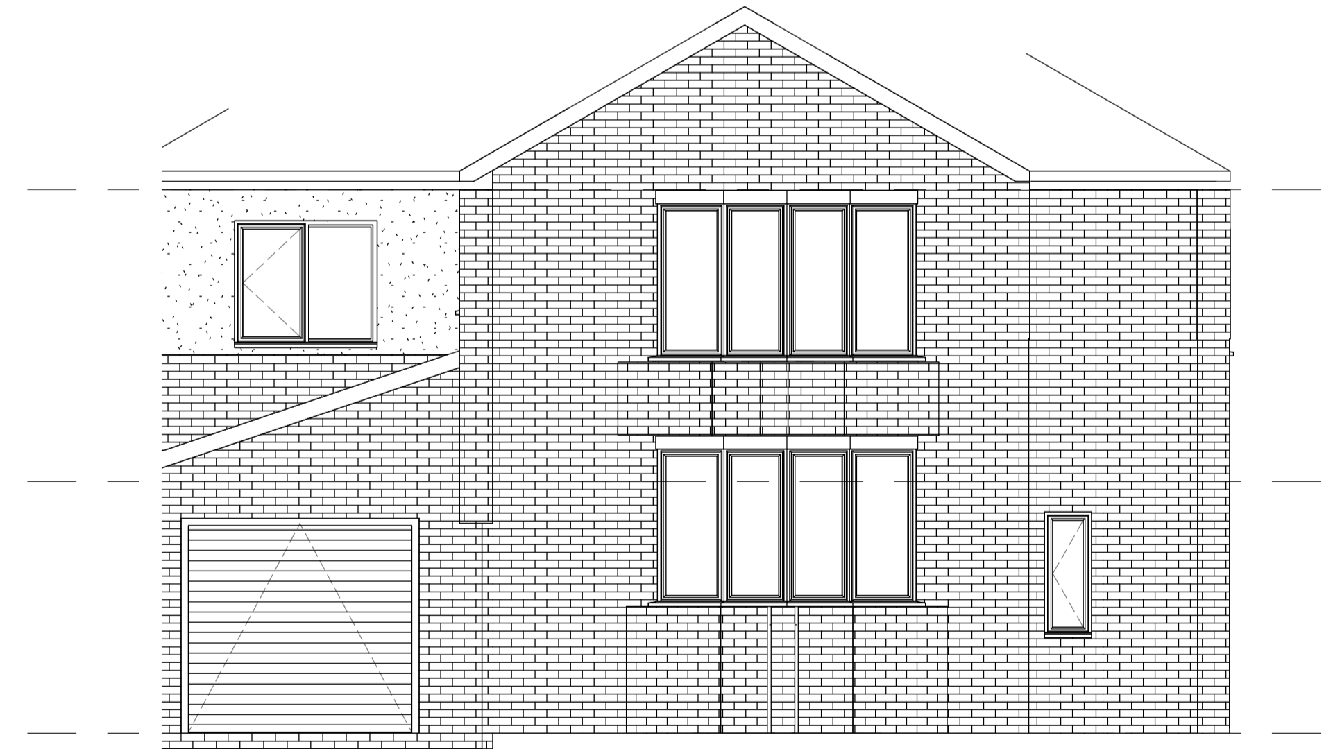
3 EXISTING SIDE ELEVATION 1 : 50