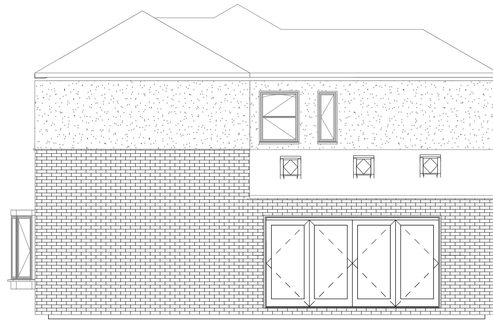
4 PROPOSED REAR ELEVATION 1 : 50