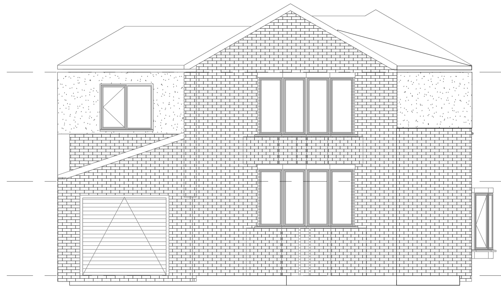
3 PROPOSED SIDE ELEVATION 1 1 : 50