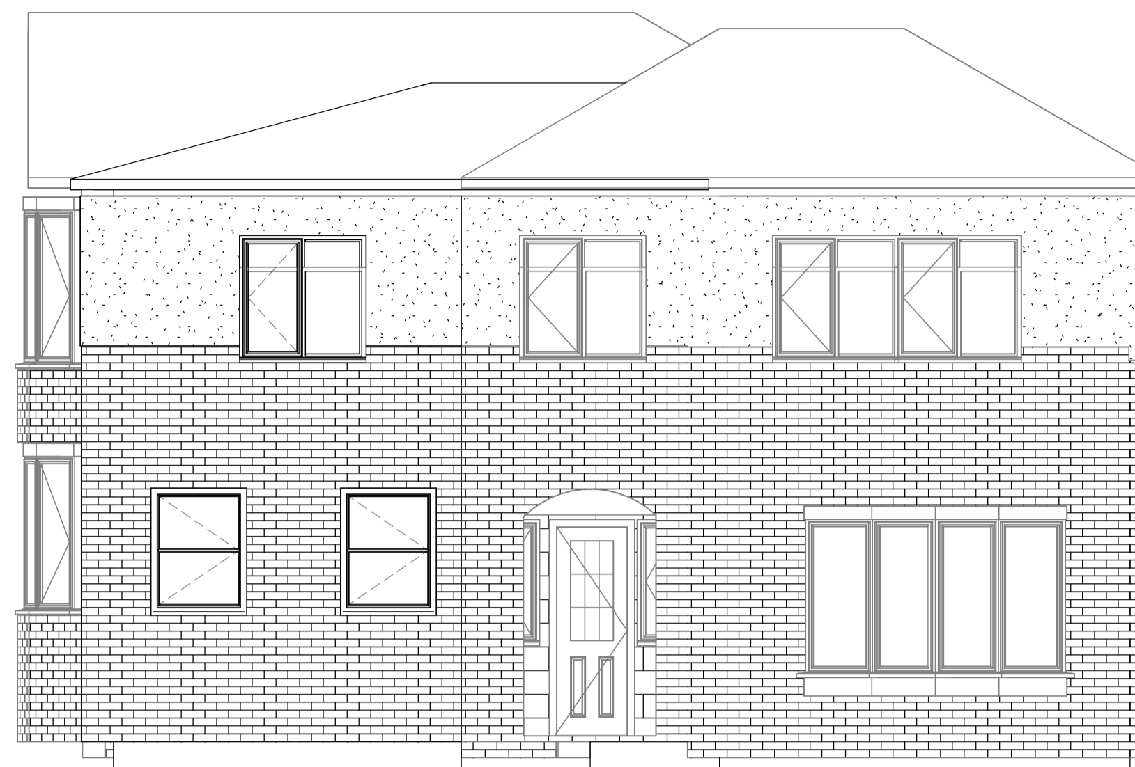
1 PROPOSED FRONT ELEVATION 1 : 50