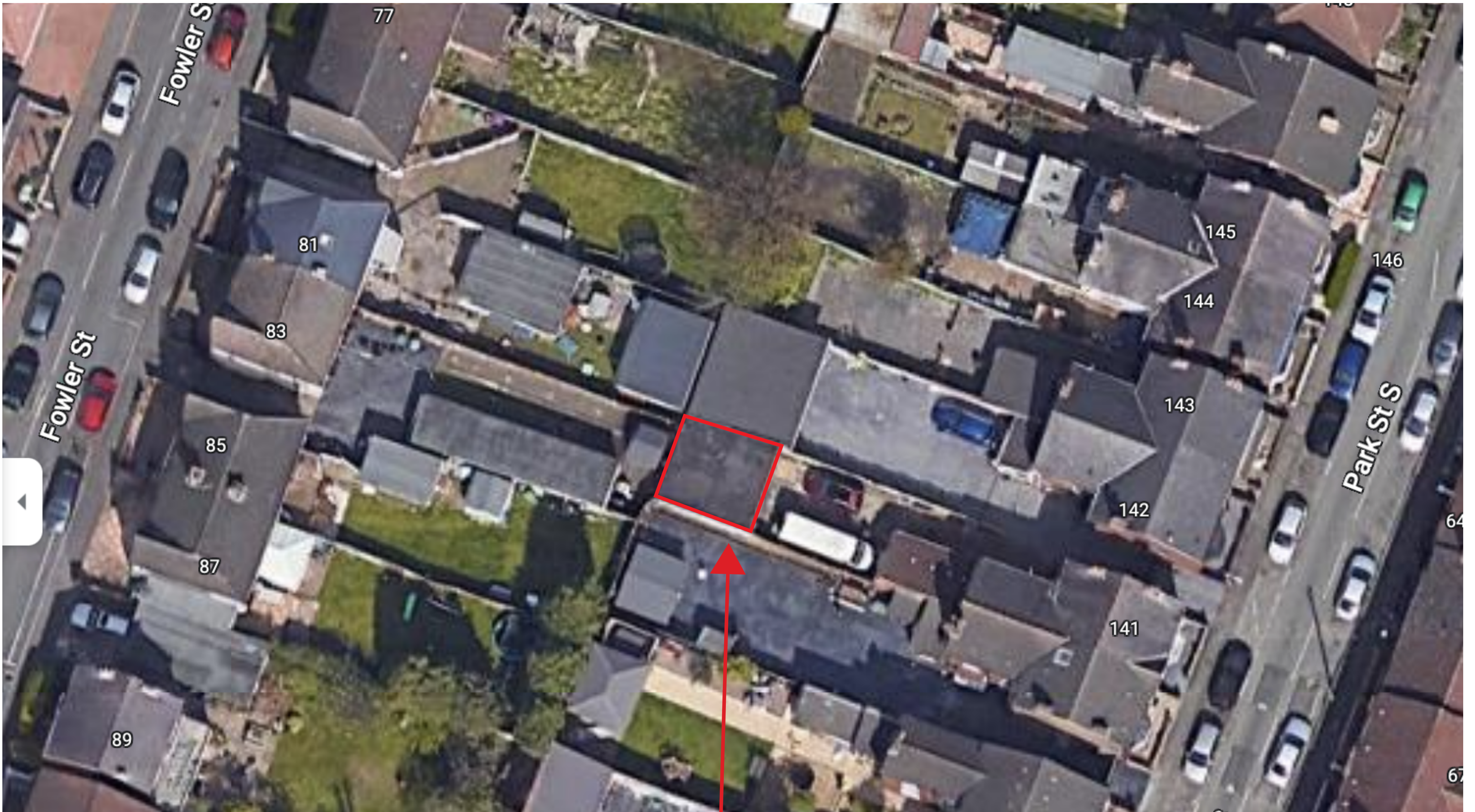
Proposed area for building works