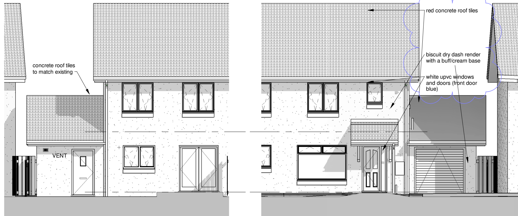
NORTH WEST ELEVATION - PR