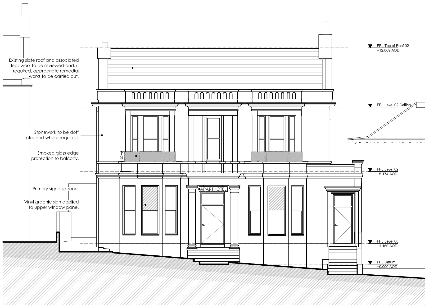
FRONT ELEVATION (as Proposed) SCALE 1:100