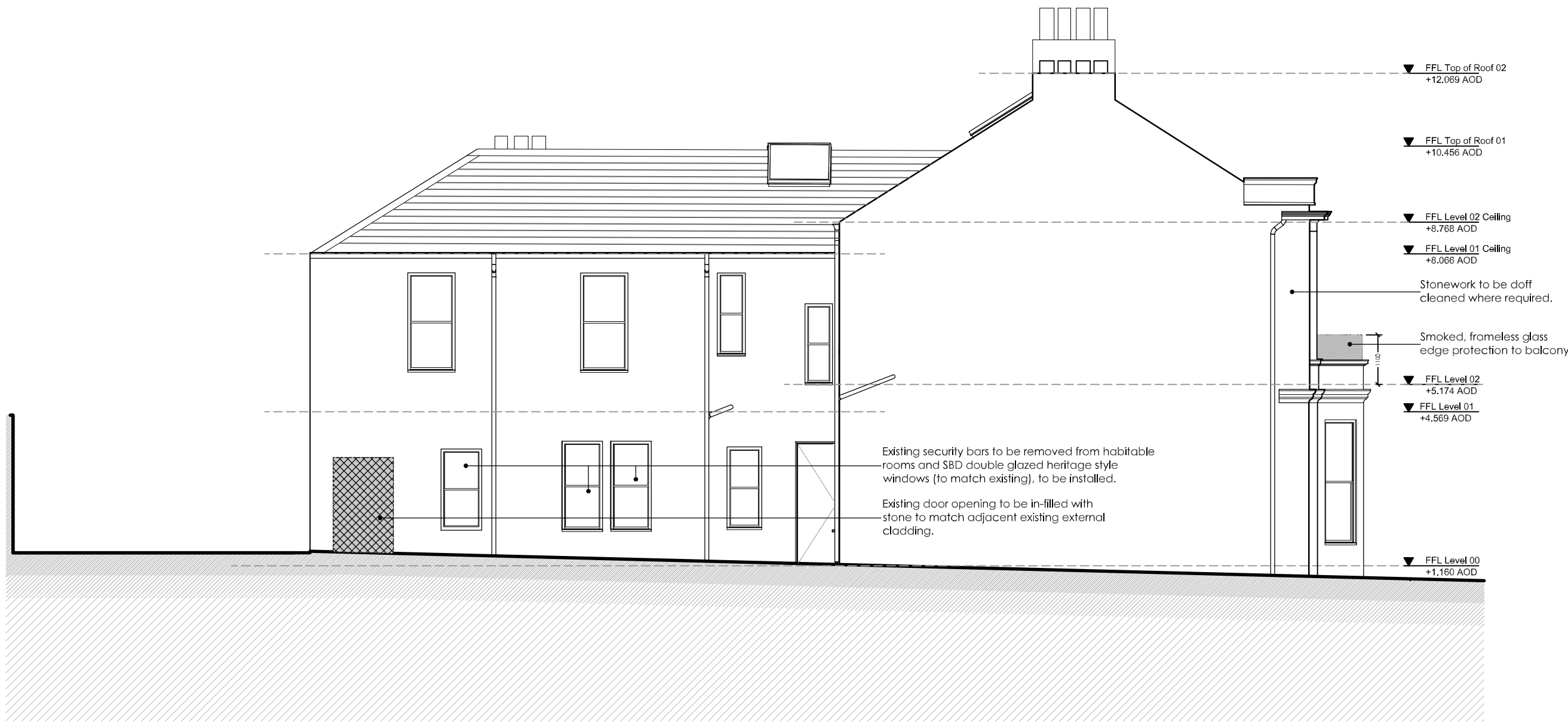
NORTH ELEVATION (as Proposed) SCALE 1:100

PROJECT Aparthotel Conversion for Able Property Ltd. at 18 Academy Street, Coatbridge ML5 3AU North Lanarkshire