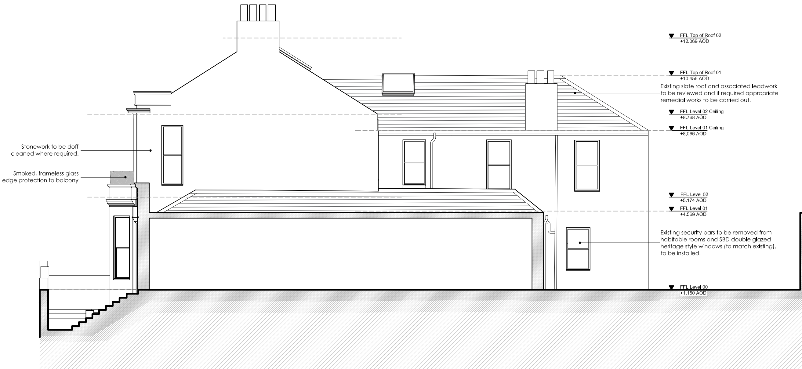
SOUTH ELEVATION (as Proposed) SCALE 1:100