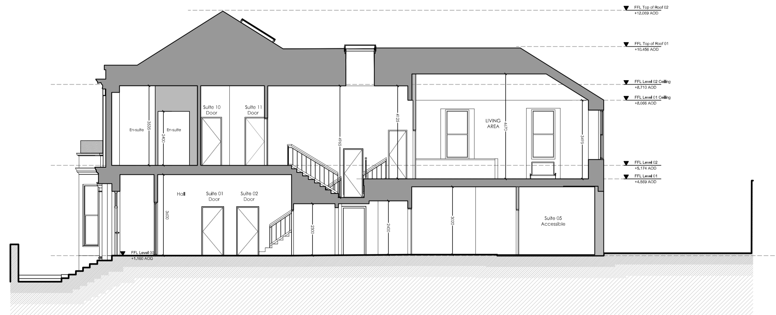
SECTION B-B (as Proposed) SCALE 1:100

PROJECT Aparthotel Conversion for Able Property Ltd. at 18 Academy Street, Coatbridge ML5 3AU North Lanarkshire