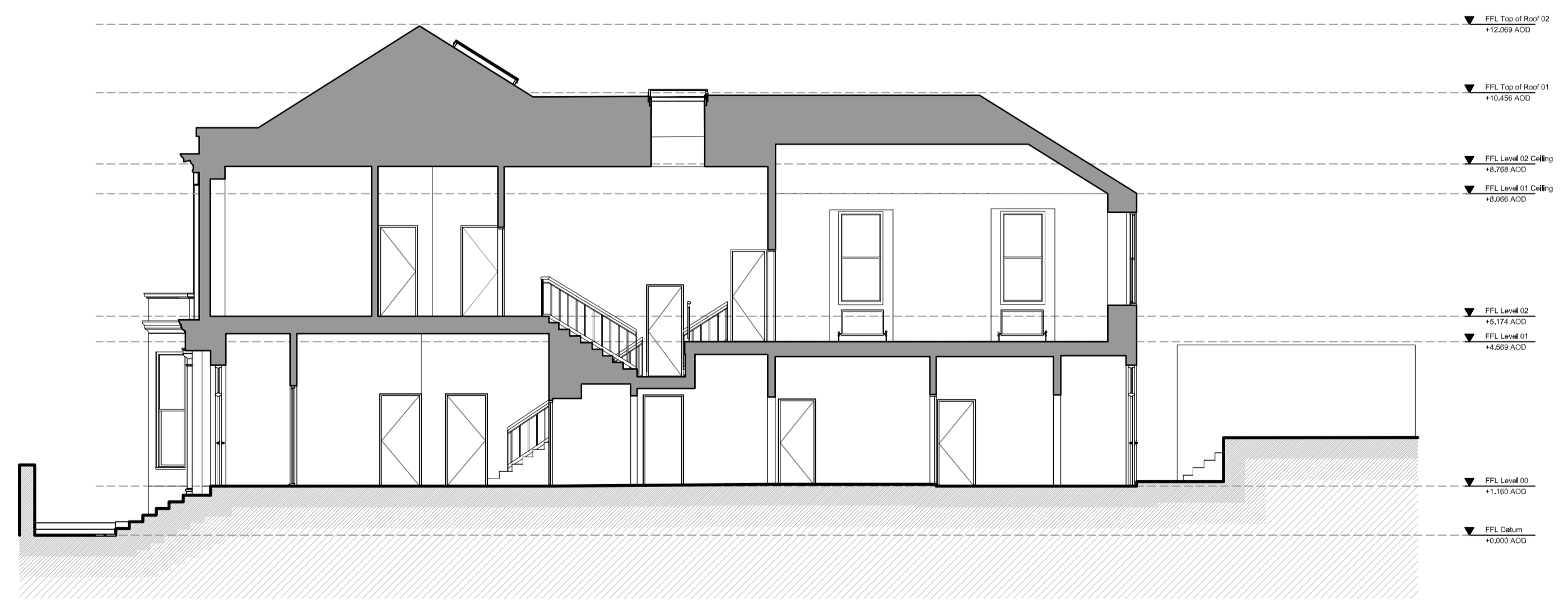
SECTION B-B (as Existing) SCALE 1:100

PROJECT Aparthotel Conversion for Able Property Ltd. at 18 Academy Street, Coatbridge ML5 3AU North Lanarkshire