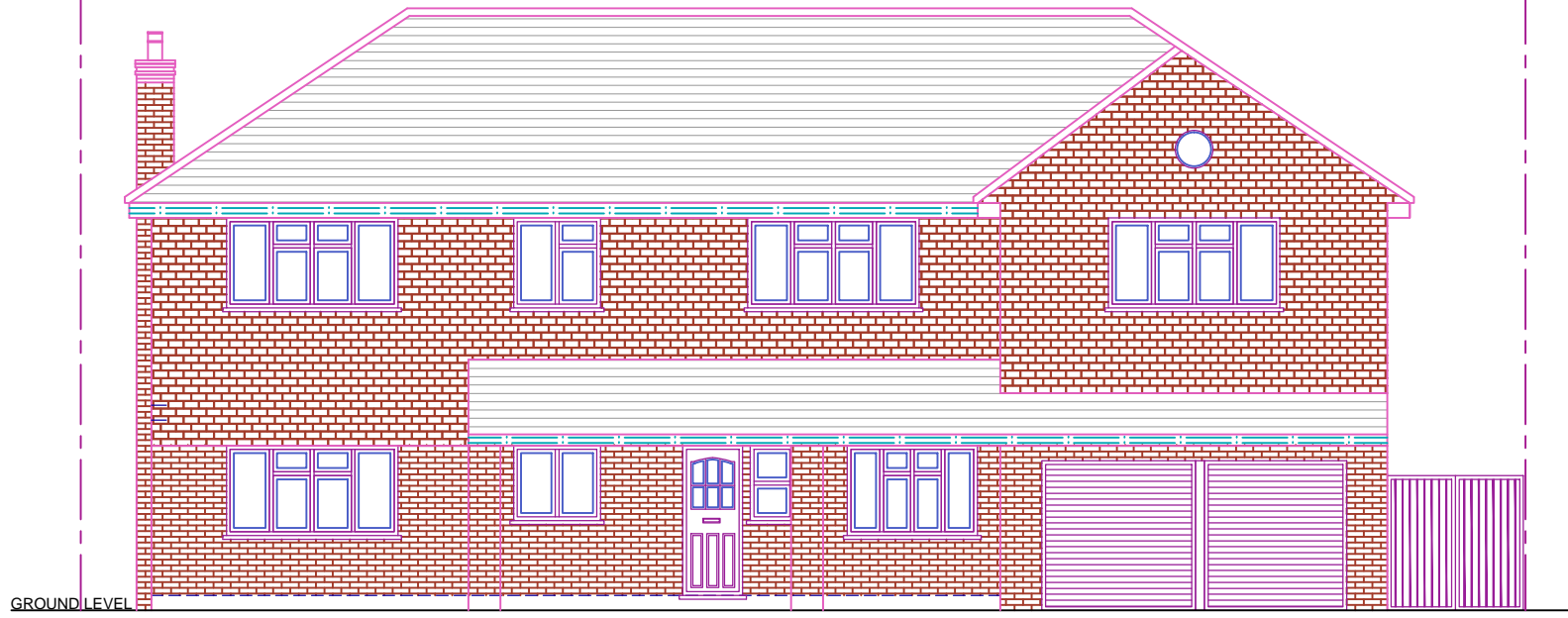
PROPOSED FRONT ELEVATION (NO CHANGES)