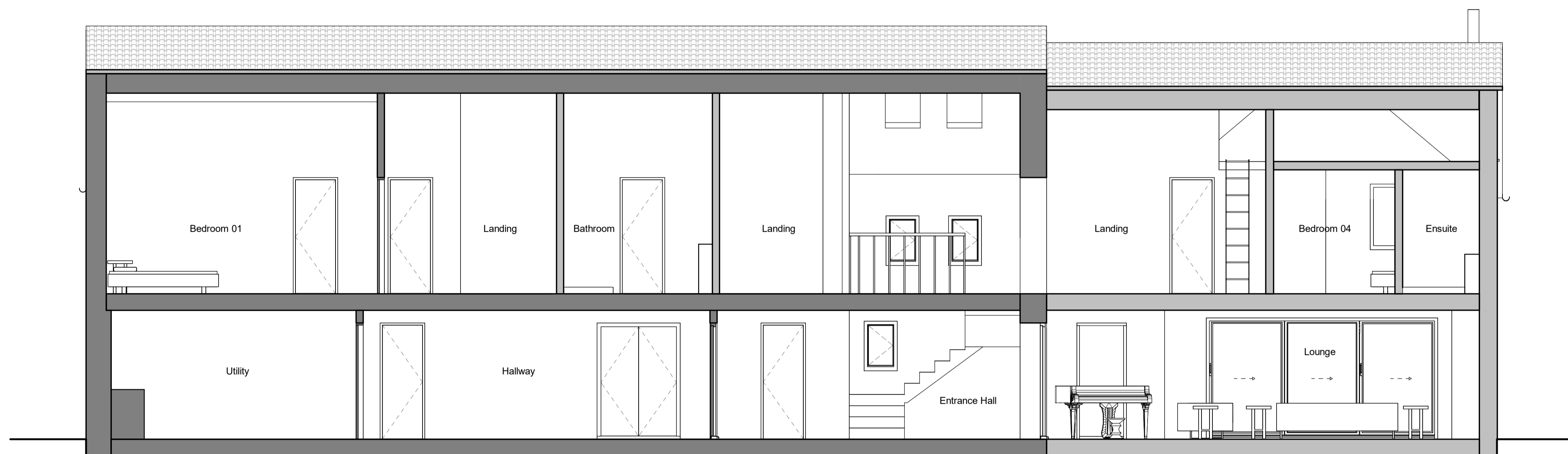
Proposed Section 02 1 : 50