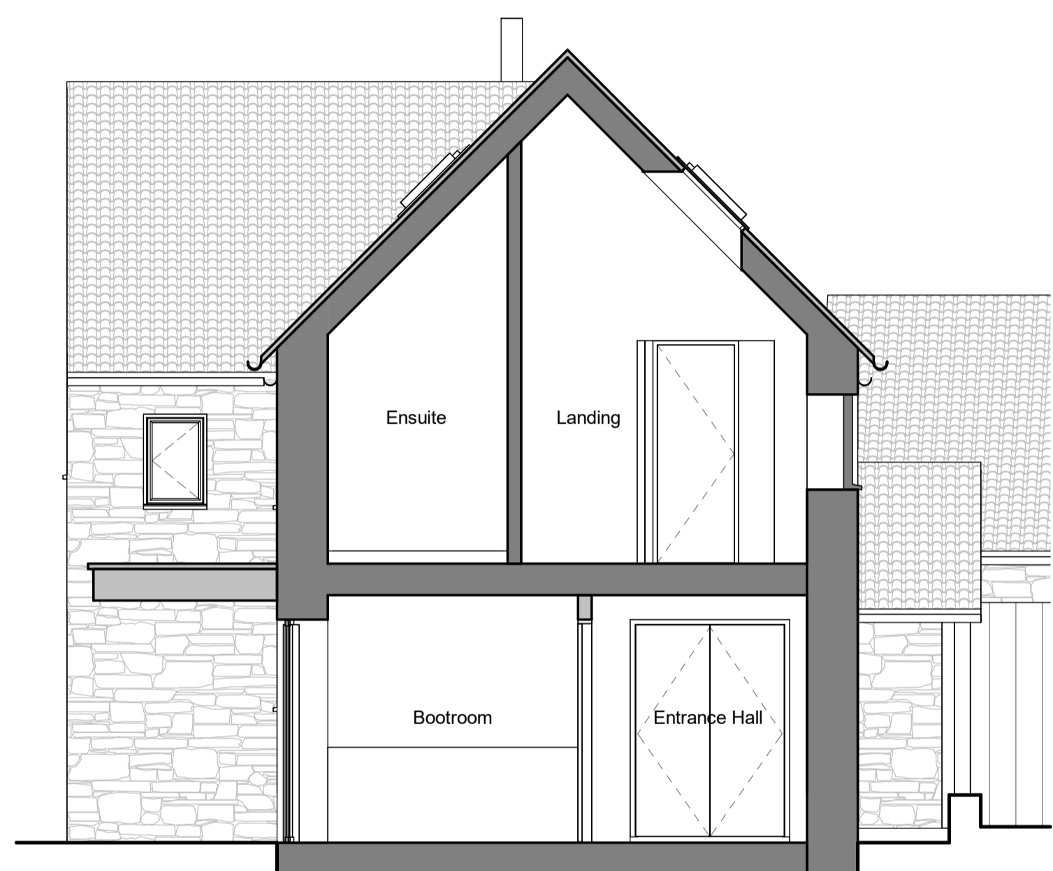
Proposed Section 01 1 : 50