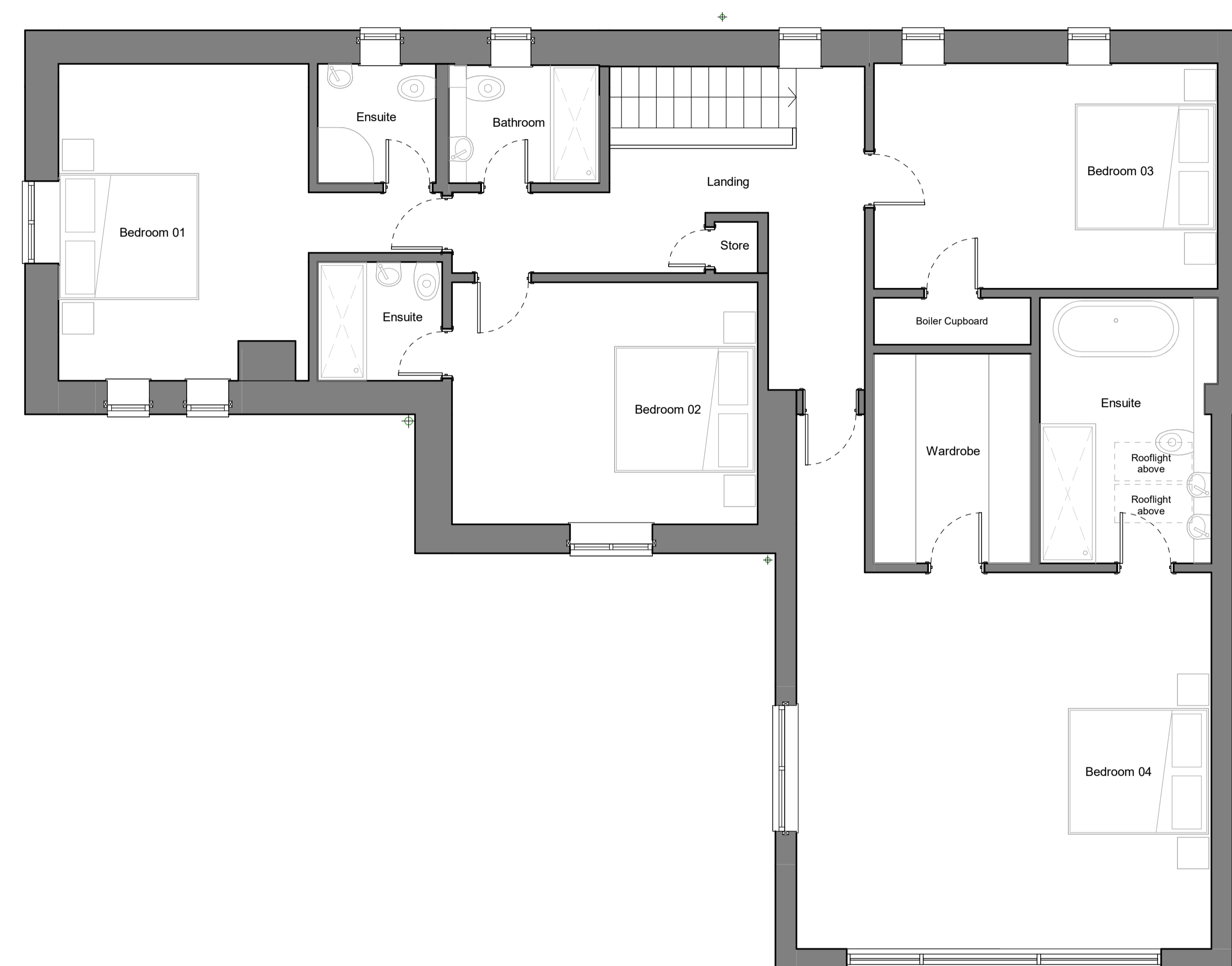
Existing First Floor Plan