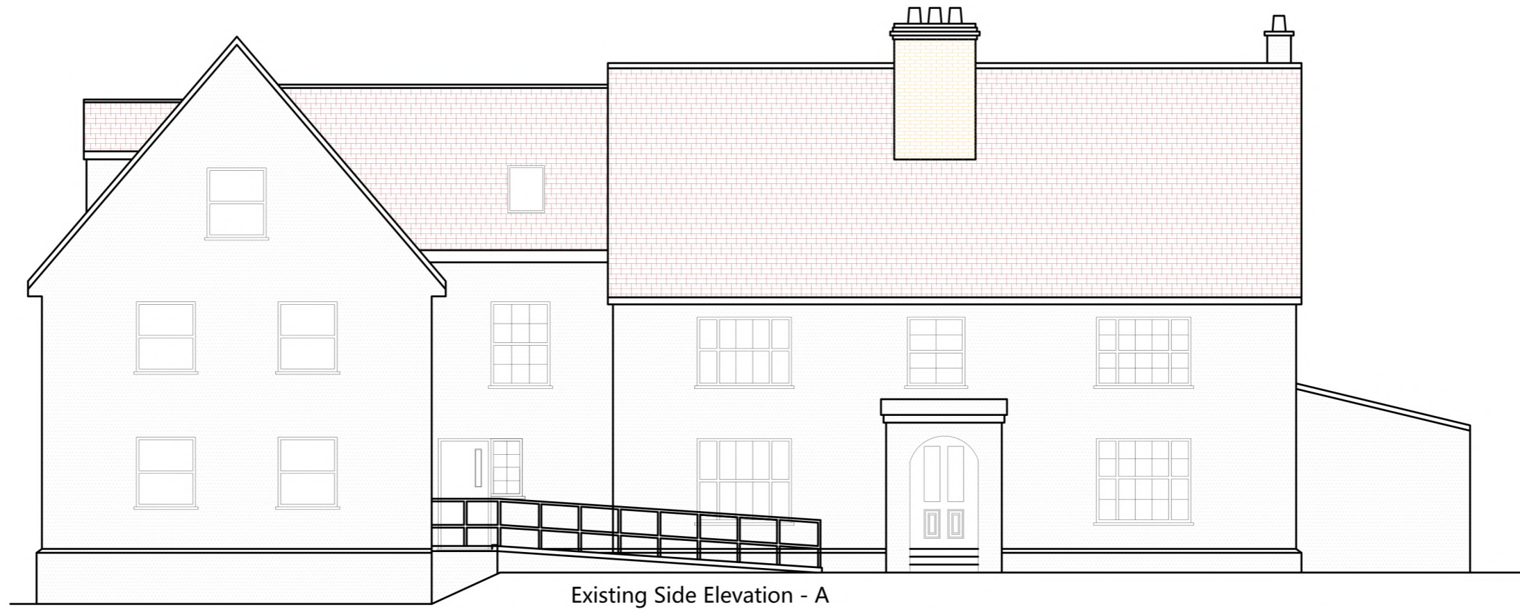
Existing Side Elevation - A