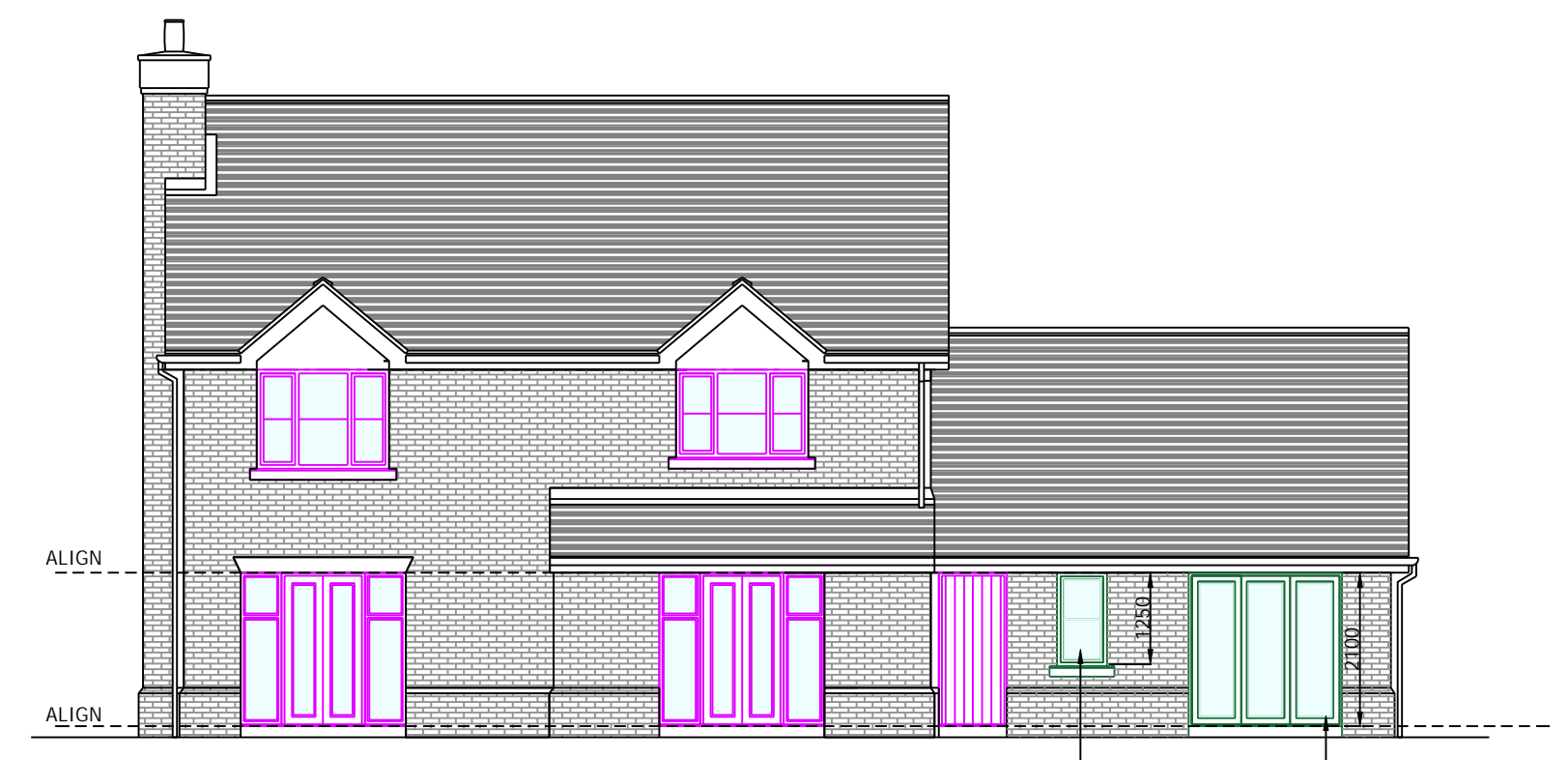
ELEVATION B: REAR ELEVATION SCALE 1:100@A1