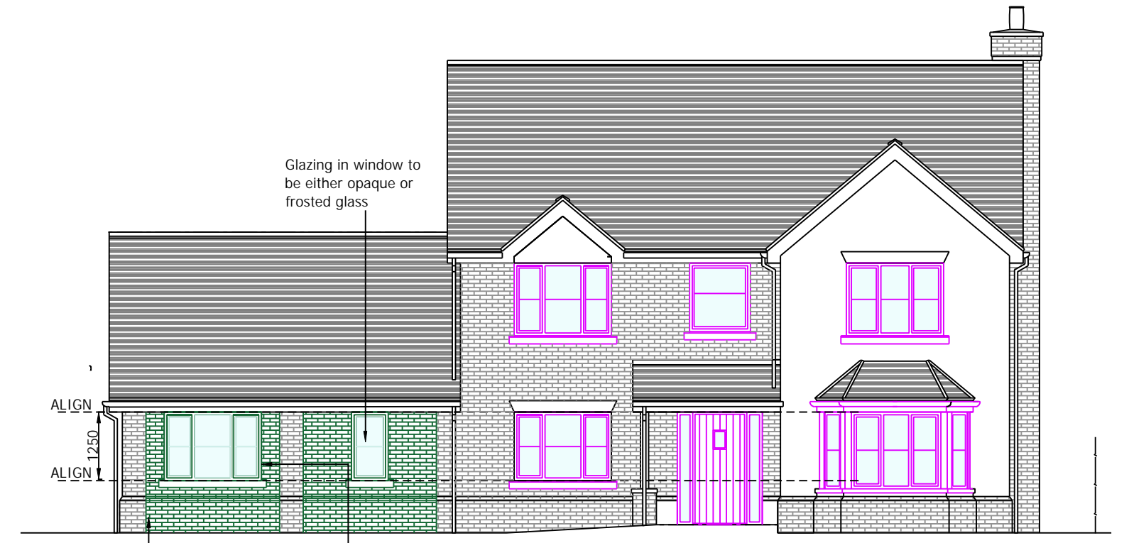
ELEVATION A: FRONT ELEVATION SCALE 1:100@A1