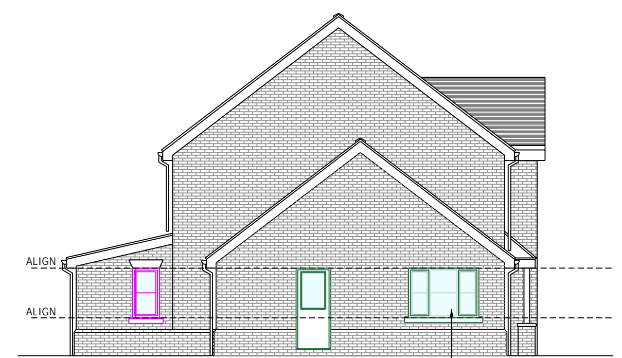
ELEVATION C: SIDE ELEVATION SCALE 1:100@A1