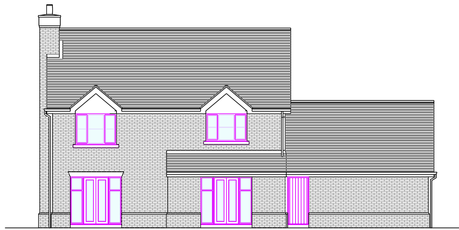
ELEVATION B: REAR ELEVATION SCALE 1:100@A1