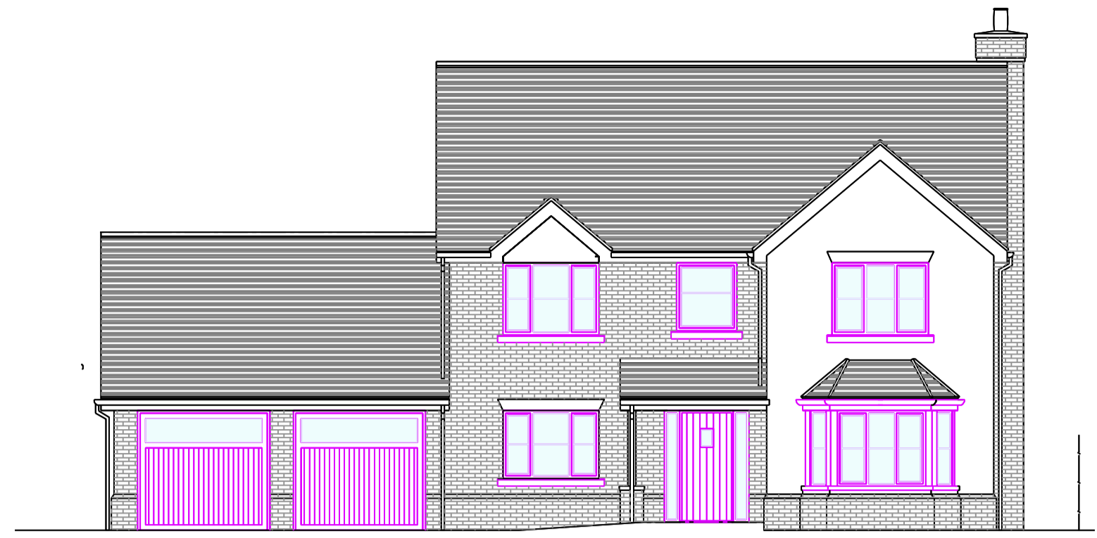
ELEVATION A: FRONT ELEVATION SCALE 1:100@A1

GENERAL NOTES: 1. THE DRAWING IS INTENDED FOR THE LOCAL AUTHORITY TO HELP ILLUSTRATE COMPLIANCE TO THE BUILDINGS REGS. SHOULD THE CONTRACTOR FOLLOW THE DRAWINGS THEY ARE TO TAKE RESPONSIBILITY FOR THE CONSTRUCTION OF THE BUILDING INCLUDING COMPLIANCE TO THE REGS. FINAL DETAILS, APPEARANCE AND LOCATION OF ANY STRUCTURAL ELEMENTS 2. DRAWINGS TO BE READ IN CONJUNCTION WITH APPROVED PLANNING DRAWINGS AND APPROVED STRUCTURAL CALCULATIONS. NO WORK IS TO COMMENCE ON SITE UNTIL ALL PLANNING CONDITIONS ARE APPROVED. 3. CONTRACTOR TO CONFIRM ALL ON SITE DIMENSIONS AND LEVELS PRIOR TO MANUFACTURE /INSTALLATION. 4. THIS DRAWING MUST NOT BE SCALED, WORK TO DIMENSIONS ONLY. 5. ANY CONSTRUCTION/MANUFACTURE DRAWINGS IN THIS DOCUMENT ARE INDICATIVE. IT IS THE RESPONSIBILITY OF THE CONTRACTOR TO ENSURE THEY ARE FIT FOR PURPOSE, AND MAKE AMENDMENTS WHERE NECESSARY. 6. THE CONTENTS OF THIS DOCUMENT ARE THE PROPERTY OF BEVERLEY ANN DESIGN LTD AND MUST NOT BE COPIED OR DISTRIBUTED IN WHOLE OR PART WITHOUT FORMAL CONSENT.